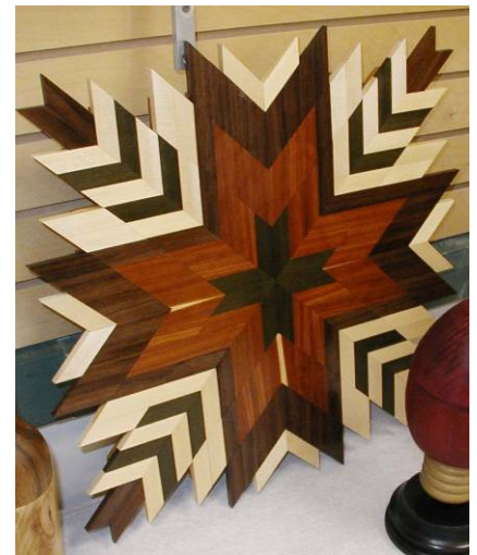
How did you turn these?