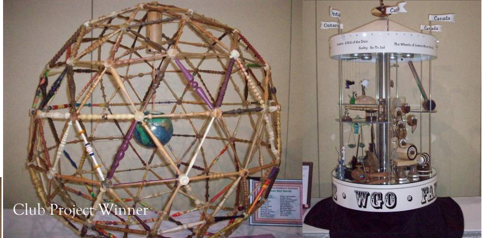
Club Project Winner