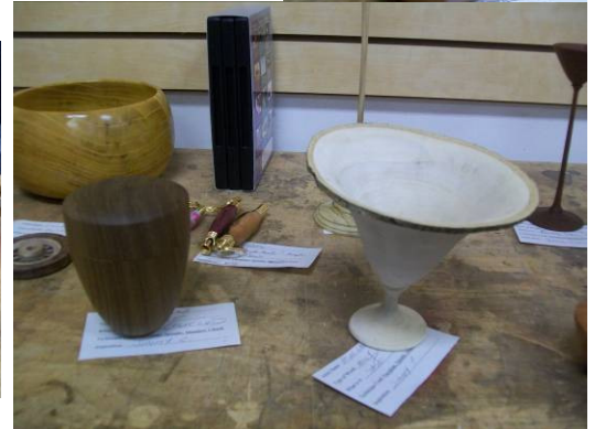
Things: Big natural edge bowl, segmented bowl, wheel, triangle bowl, drum, key rings, goblet, lidded box