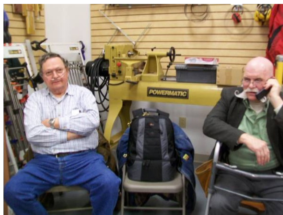
A few auction goodies