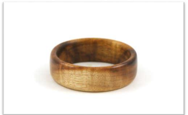
Chuck Horton, Hawaiian Koa, Wipe on Poly, 3 1/2"