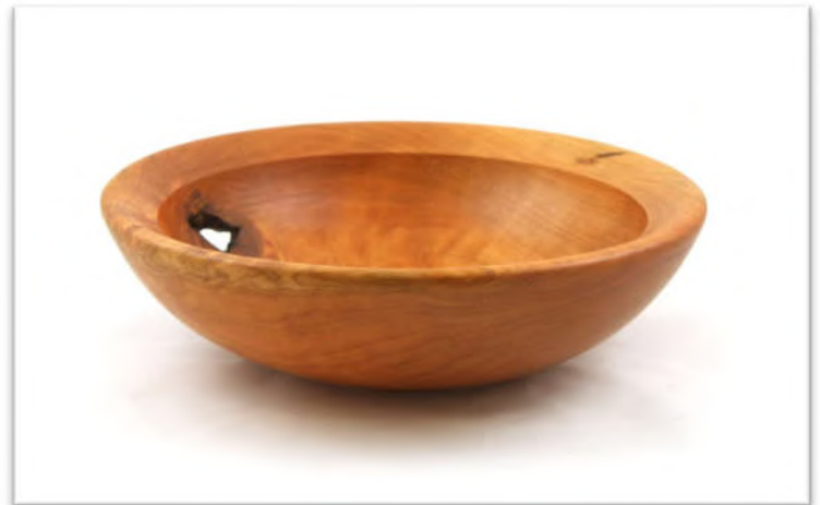
Charlie Hamilton, Cherry, Walnut Oil, 12"