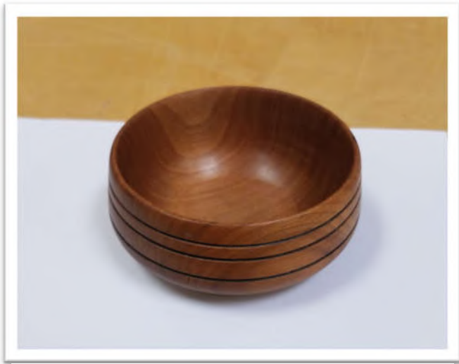
Meg Turner, Cherry(?), 4"