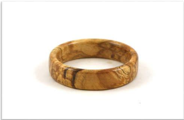
Chuck Horton, Spalted Bradford Pear, Wipe on Poly, 3 1/4"