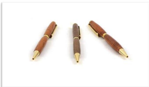
Kim Zorn, Bubinga & Walnut, Woodturners EEE