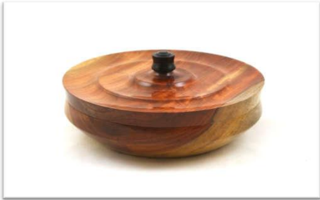
Robert Gundel, Camphor, Buffed & Waxed, 8" X 2½"