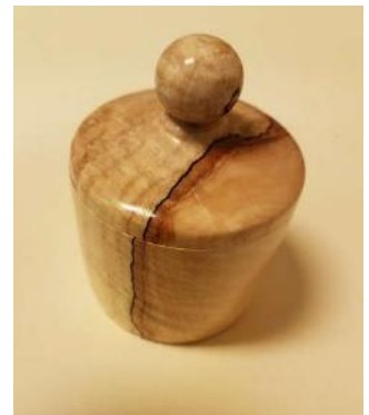
Tenon on Cover