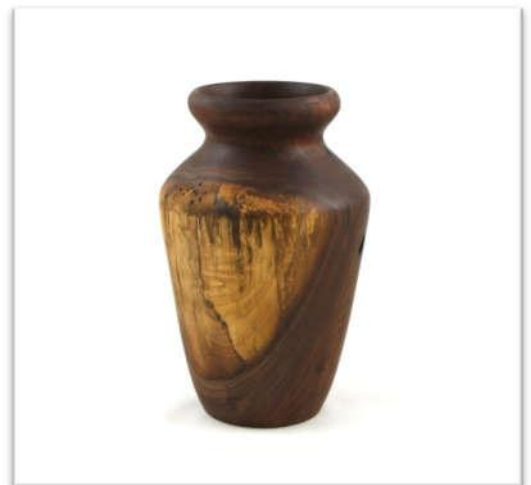
Cody Walker, Spalted Maple, Mineral Oil, 8"