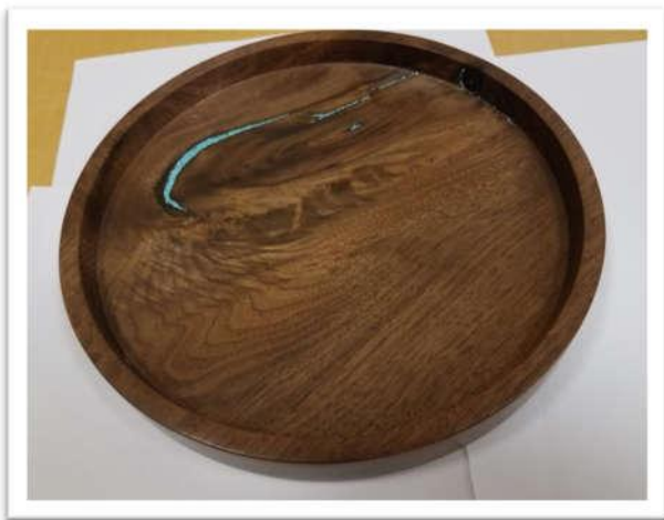
Ned Robertson, Walnut and Turquoise, Tung Oil & Buffing System