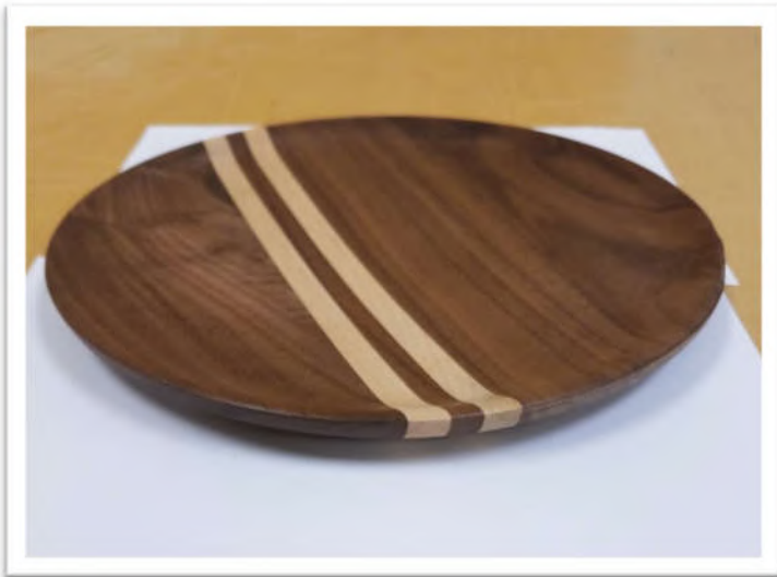
Ned Robertson, Walnut & Maple, Tung Oil & Buffing System