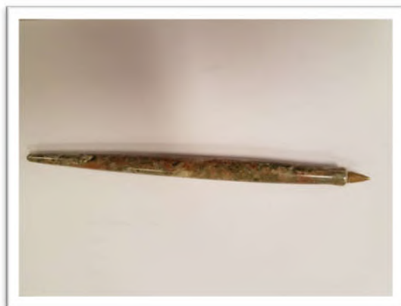
Ed Wood, Corian & Bic