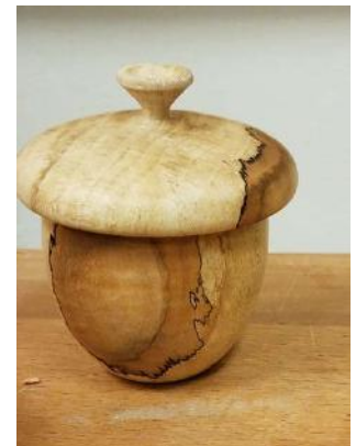
Tenon on Box, Cover wraps around box