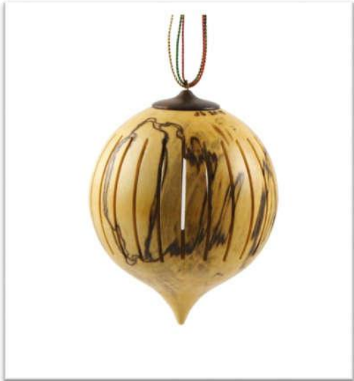
Jim Bumpas, Spalted Maple, Waterlox, 3", Ornament