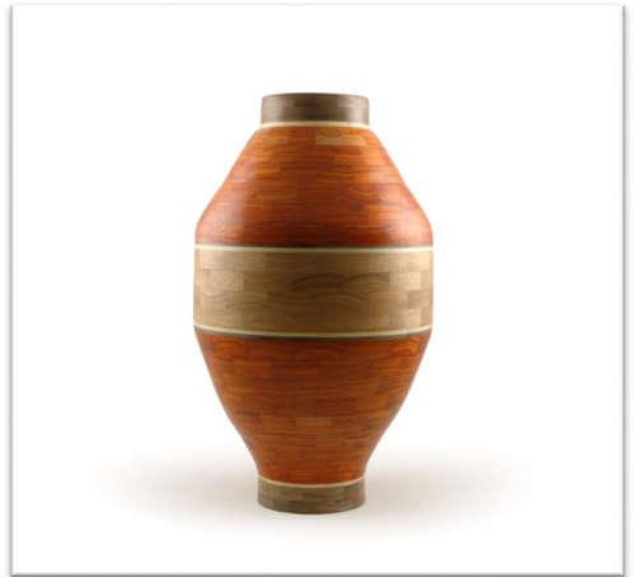
Terry Moore, Padauk/Mahogany/Walnut/Maple, 19"