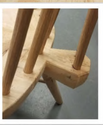
BILL JENKINS, OAK & PINE, IN PROGRESS, 30 TALL, BY 22 WIDE,