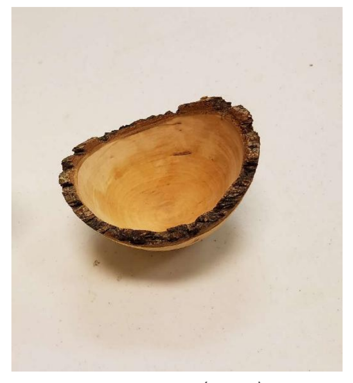
TURNING IS FINISHED (FOR NOW)