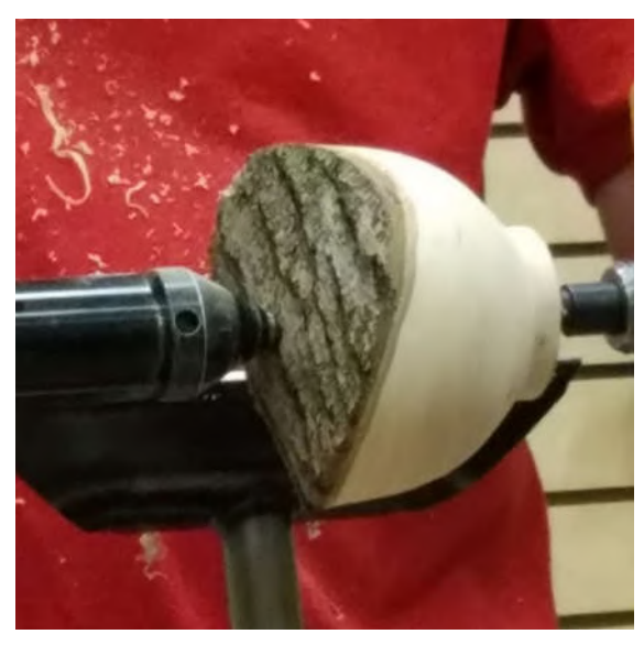
The outside is finished, and chuck tenon has been formed.