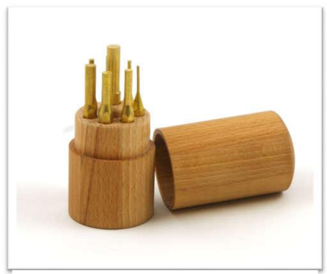
DAN LUTTRELL, MAPLE, MINERAL OIL FINISH, PUNCH CASE WITH PUNCHES