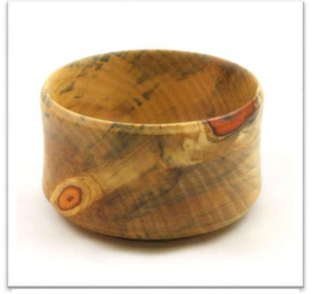
GEORGIA WOOD, NORFOLK ISLAND PINE, WALNUT OIL, 6 X 3½