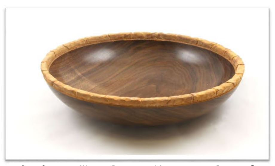
STEVE SCHWARTZ, WALNUT, POLY FINISH, 14 INCH DIAMETER, BLEACHED & CARVED RIM TO LOOK LIKE STONES