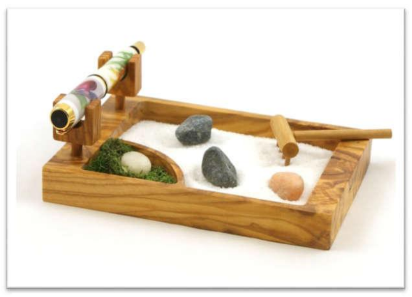
BRUCE ROBBINS, OLIVE WOOD, BUFFED FINISH, 4 X 7