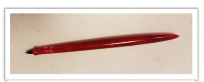
ED WOOD, CORIAN, POLISHED