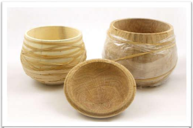
CHUCK HORTON, HOLLY, UNFINISHED, 6 X 6, DAMP, TRYING TO CLOSE A SPLIT (ON RIGHT) OAK, UNFINISHED, 6 X 8, STILL WET,