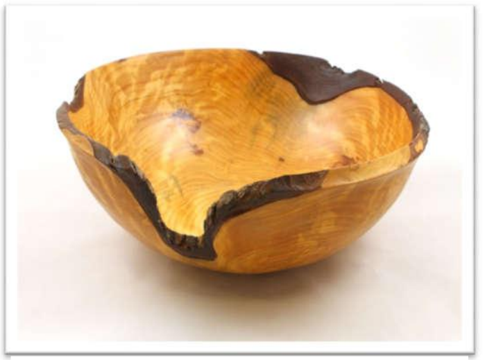
BARRY IRBY, PINE BURL, DEFT LACQUER, 13 X 6