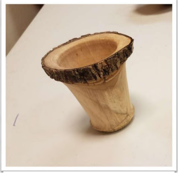
BARK EDGE IS AROUND END GRAIN