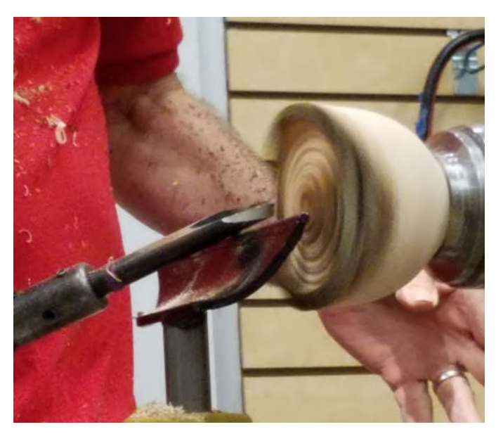
Forming the inside