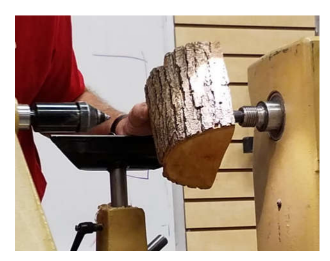
MOUNTED PERPENDICULAR TO THE LATHE BED