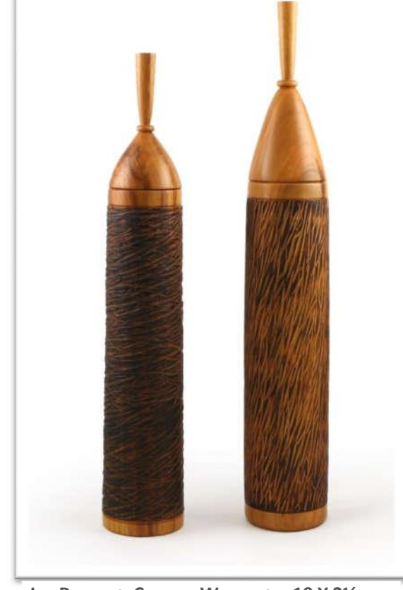
JIM BUMPAS. CHERRY, WATERLOX, 19 X 3½ AND 17 X 3½, TALL BOXES