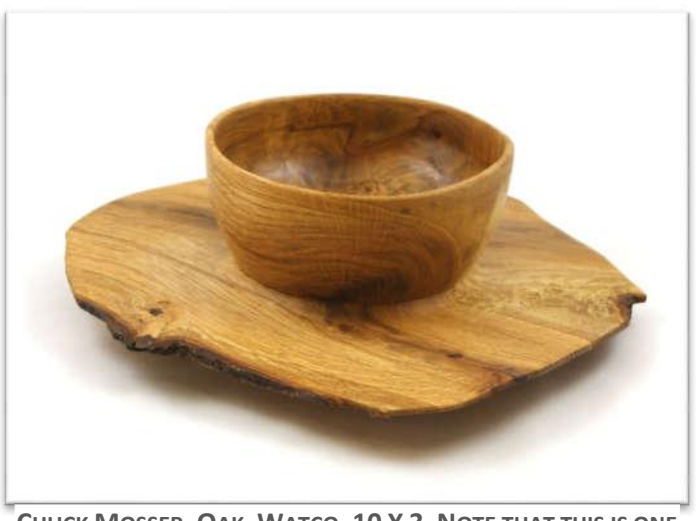
CHUCK MOSSER, OAK, WATCO, 10 X 3, NOTE THAT THIS IS ONE PIECE OF WOOD