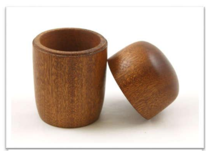
CHRIS VIEWEG, MAHOGANY, LINSEED/FRICTION POLISH, 3½ X 5