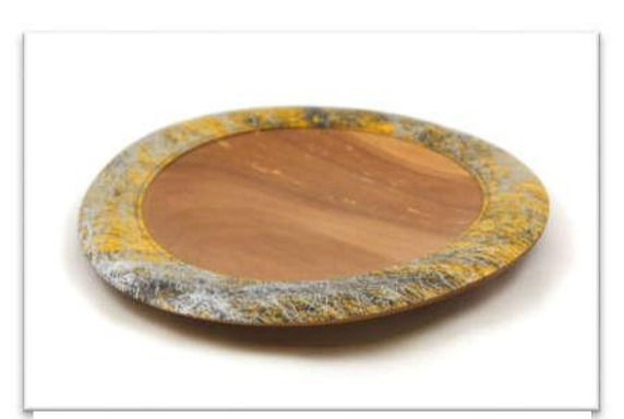
BOB SILKENSEN, SYCAMORE, LACQUER FINISH, 7 INCH PLATTER, SPIDER PAINT