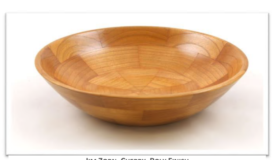
JIM ZORN, CHERRY, POLY FINISH