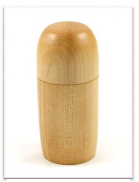
CHRIS VIEWEG, MAPLE, LINSEED/FRICTION POLISH, 2½ X 5