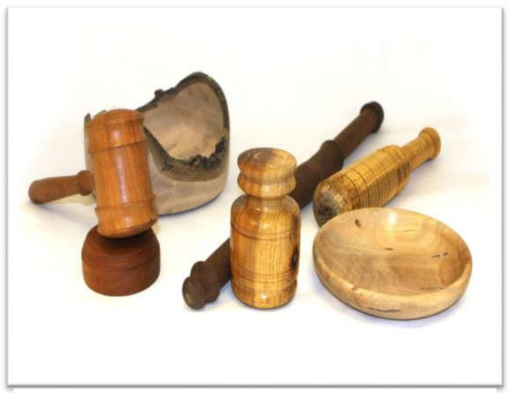
GREG CORBET, WALNUT & ROCK MAPLE, HIGHSPEED WAX; BOWLS, GAVELS, SPURTLE & MASHER