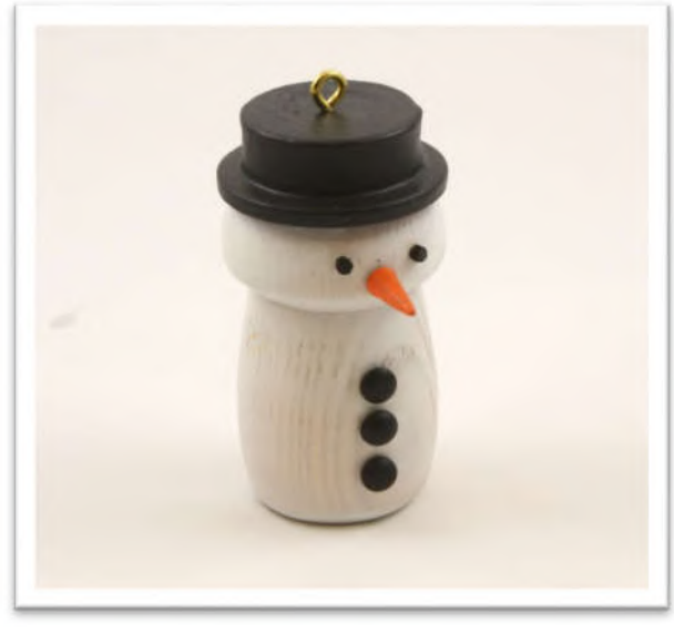
BETSY MACK, POPULAR, PAINT FINISH, METRIC