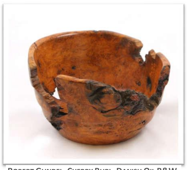
ROBERT GUNDEL, CHERRY BURL, DANISH OIL B&W, 10 X 6