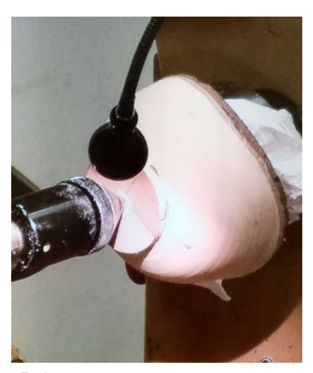
THE INSIDE IS FINISHED AND THE PIECE IS REVERSED ON THE CHUCK WITH A BUFFER OF CLOTH COVERING THE CHUCK. THE TENON IS REMOVED TO FORM A SUITABLE FOOT