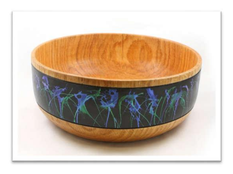
ROYAL WOOD, RED OAK, WALNUT OIL FINISH, 15½ X 5½, WITH COSMIC CLOUD EMBELLISHMENT