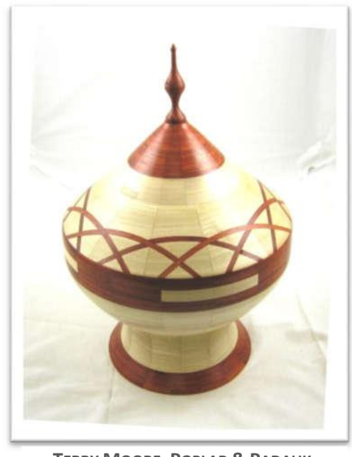
TERRY MOORE, POPLAR & PADAUK, GENERAL, 10 x 14, 205 PIECES