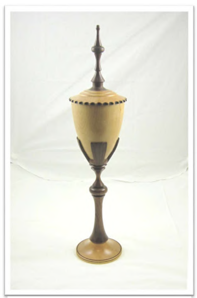
DOUG MURRAY, MAPLE & WALNUT, POLYURETHANE, 4 x 19, LIDDED CHALICE