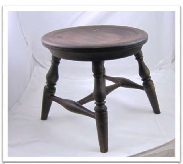
BILL JENKINS, WALNUT, 12 X 12 HIGH, LAST OF AN ORDER OF 12