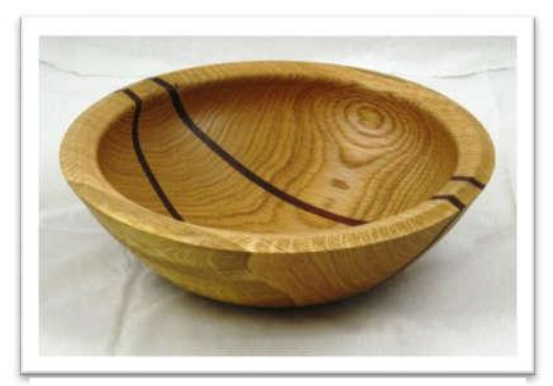
CHUCK MOSSER, OAK & PADAUK, WATCO OIL