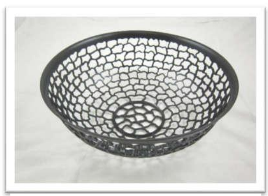
DAN LUTTRELL, MAPLE, PAINTED, 11 x 4, PIERCED BOWL