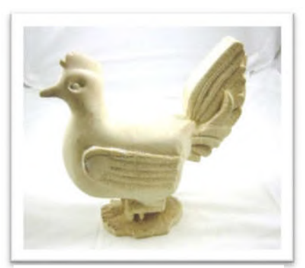
ROLLIE S, BASSWOOD, 4 x 4 x 12, CHICKEN