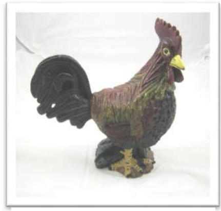
ROLLIE S, BASSWOOD, 4 x 4 x 12, CHICKEN ROOSTER