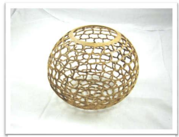
DAN LUTTRELL, MAPLE, LACQUER, 6¼ x 6¼, PIERCED FISH BOWL