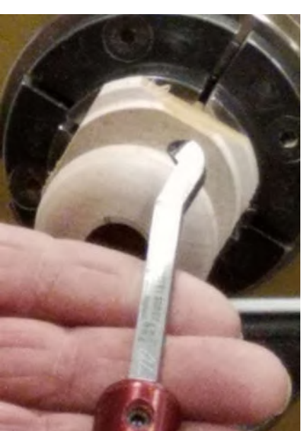
Some of the tools Alam used