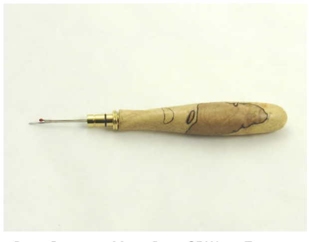
DAVID BUSHMAN, MAPLE BURL, GF WOOD TURNERS, SEWING TOOL – SEAM RIPPER