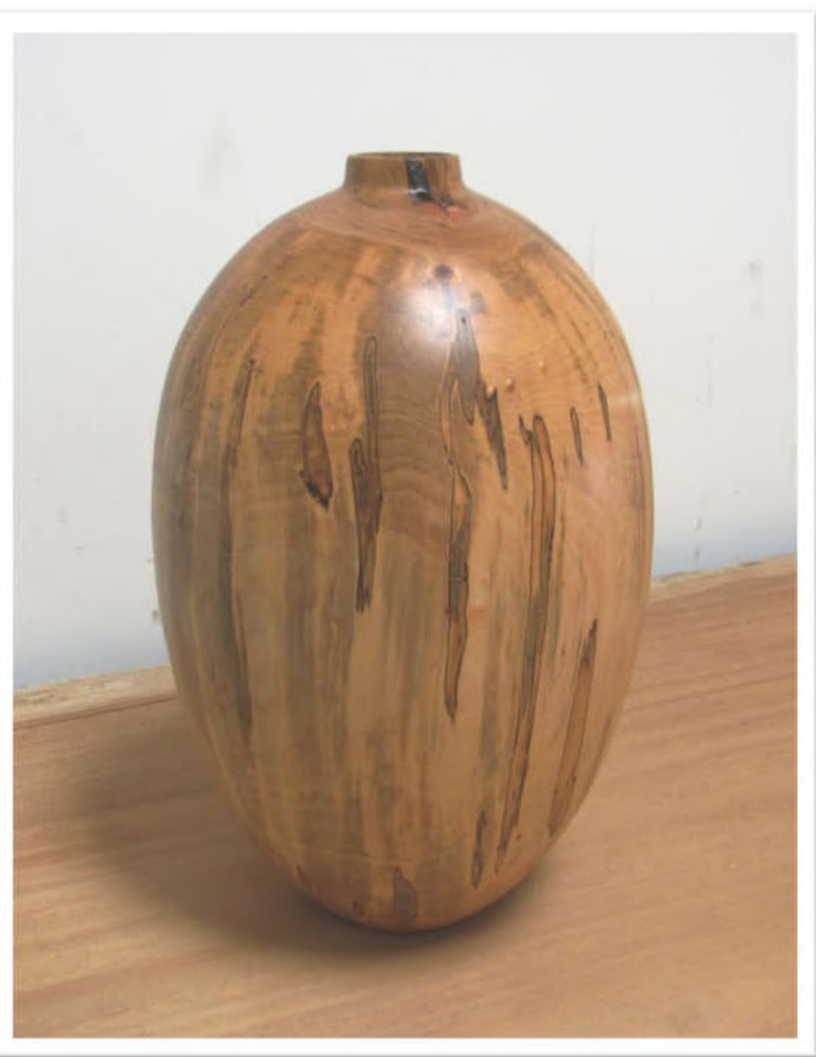
JIM BUMPAS, AMBROSIA MAPLE, LACQUER, 23 X 15, FRONT AND BACK VIEWS