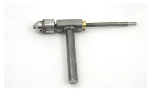
RAY DEYO, DRILL GUIDE WITH DEPTH STOP AND MOUND POST FOR BANJO