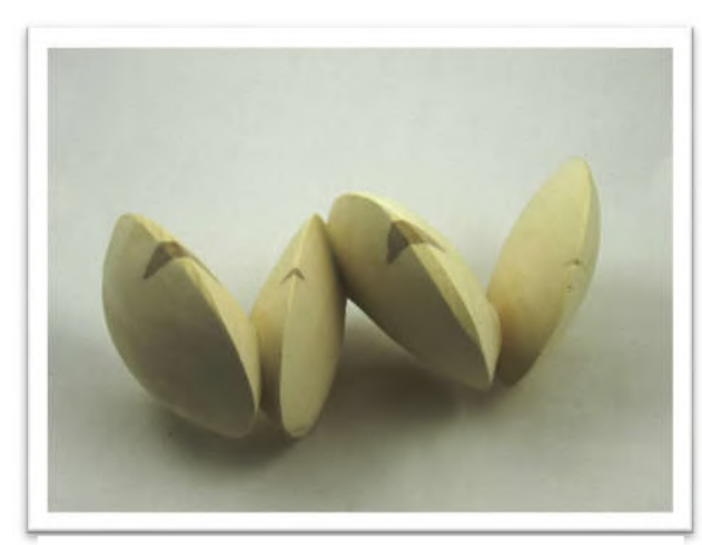
BARBARA DILL, HOLLY, NO FINISH, 12 X 4, MULTI AXIS TURNED SCULPTURE