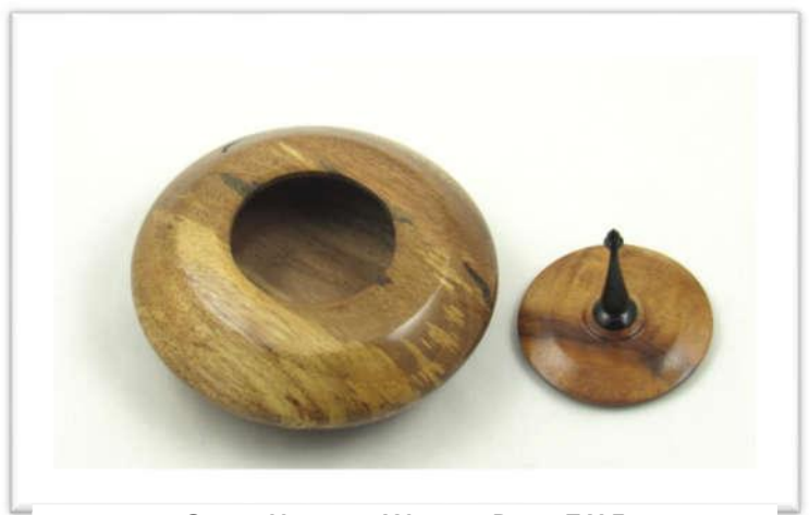
CHUCK HORTON, WIPE ON POLY, 7 X 5