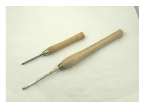
LEE SCARBROUGH, MAPLE & STEEL, SCRAPER