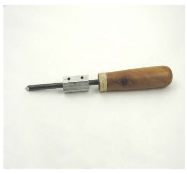
ROBERT GUNDEL. THREE FACE-POINTED PYRAMID TURNING TOOL