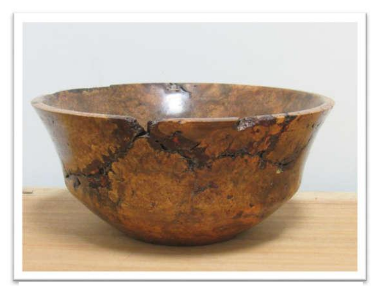
ROBERT GUNDEL, MAPLE BURL, BUFFED & WAXED, 14 X 8