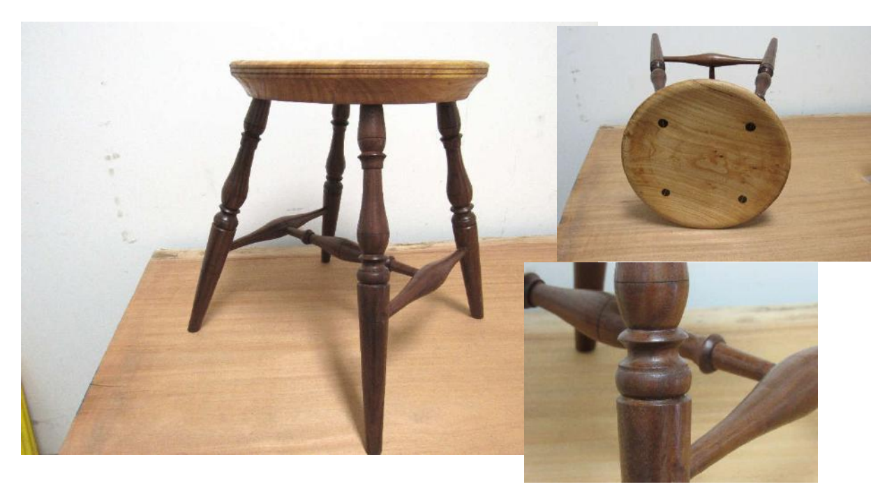
BILL JENKINS, WALNUT & PINE, WINDSOR STOOL, WITH DETAIL OF LEG AND SEAT