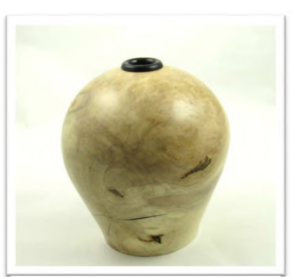
RON BISHOP, HOLLY & EBONY, MICRO CRYSTALLINE WAX, 12 X 6, UNUSUAL HOLLY BURL