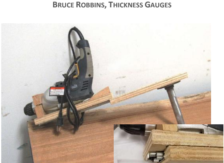
CODY WALKER, DRILL JIG WITH SLIDE DETAIL