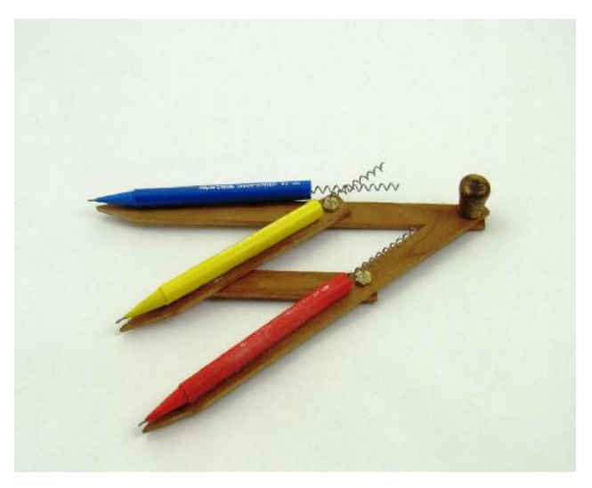
GALEN RICE, GOLDEN SECTION RULE