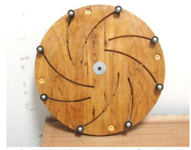
ROYAL WOOD, PLYWOOD, WALNUT OIL, 19 INCH LONGWOOD CLAMP