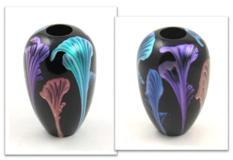
BOB SILKENSEN, MAPLE, VASE, TWO VIEWS