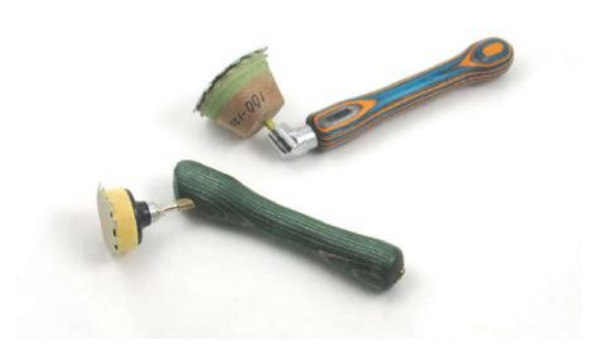
BOB SILKENSEN, PLYWOOD, WALNUT OIL FINISH, SANDING TOOLS