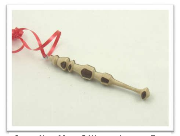
SHERRY NEFF, MAPLE & WALNUT, LACQUER, TREE ORNAMENT