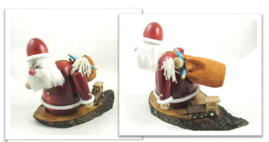
CHUCK BAJNAI, POPLAR, DYE AND POLY, SANTA ORNAMENT