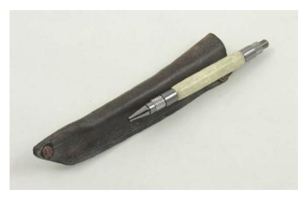
MISSING TICKET, NICE PEN