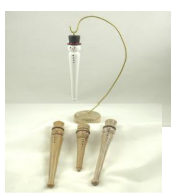
Sherry Neff, Poplar & Oak, White Paint