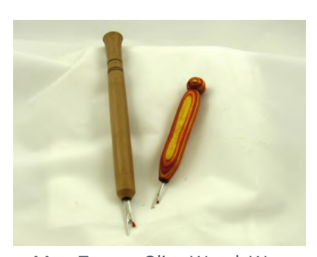
Meg Turner, Olive Wood, Wax,