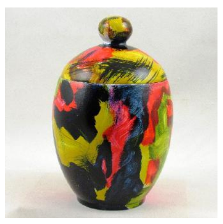
Chuck Horton, Multi-Colored Box