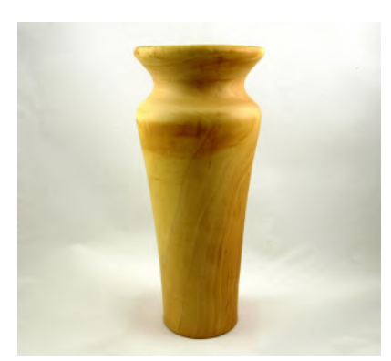
Steve Kellner, Bradford Pear, BLO, 12" X 6" dia. More Hollowing Practice