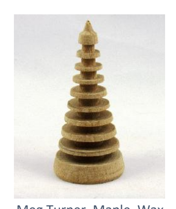
Meg Turner, Maple, Wax