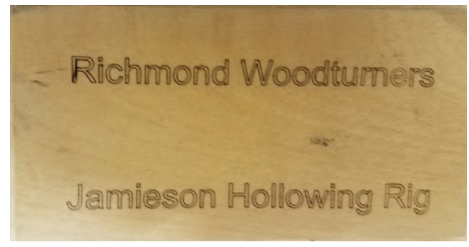
Jamieson Hollowing Rig large 3 X 12 X 24 Wooden Box