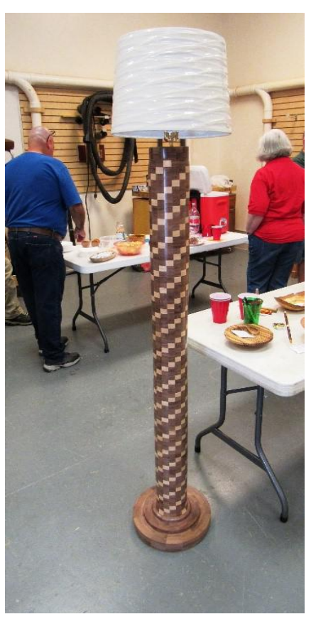
Terry Moore, Maple & Walnut , 60"