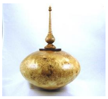
Robert Gundel, Maple Burl & Walnut, Curly Maple Finial, CA, 10" X 9"