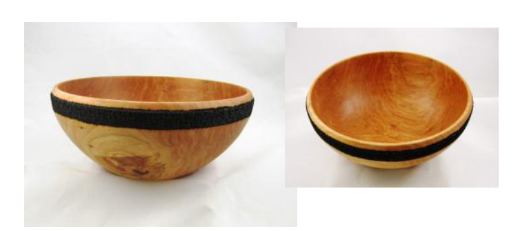
Cody Walker, Cherry, Walnut Oil, Basket Weave Decorative ring, 10" X 4.25"