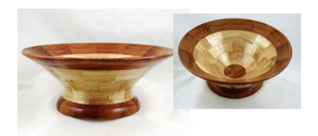
Royal, Wood, Bubinga & Maple, Lacquer & Yorkshire Grit, 11" X 4"