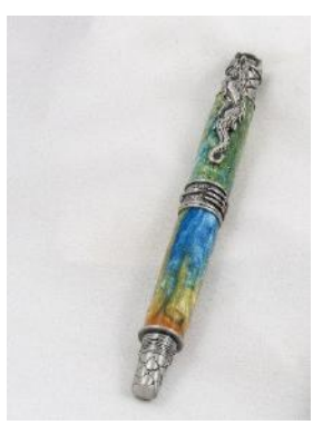
Phil Duffy, Acrylic, Polish (12k grit). 7", Pen