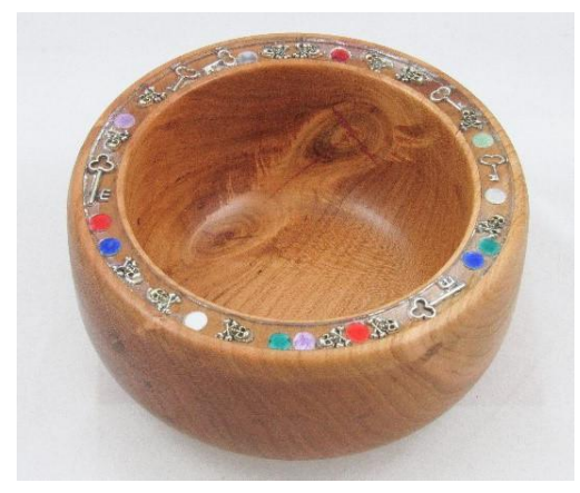
Georgia Wood, Walnut, Yorkshire Grit & Shine Juice, 6"d X 2¾", An Experiment in Resin & Trinkets