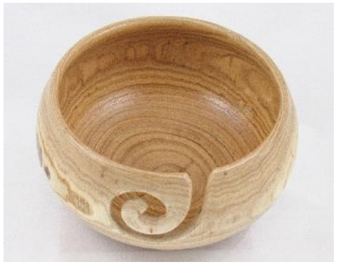
Brad Miller, Paulownia<u>,</u> Polyurethane, 8" X 5", Used for Balls of Knitting/ Crochet Yarn