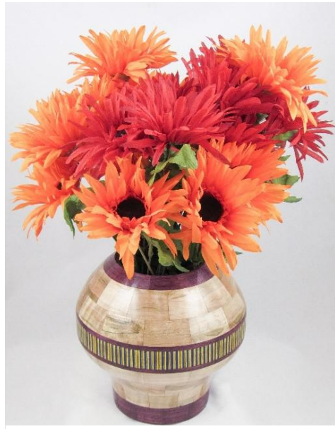
Royal Wood, Maple/Purpleheart, Shellac & Yorkshire Grit, 7" X 7"