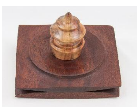
Phil Duffy, Mahogany and Maple, Turners Finish, 6" X 6"