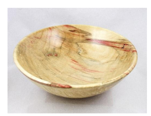
Robert Gundel, Box Elder, Buffed & Waxed, 11"w X 4"h