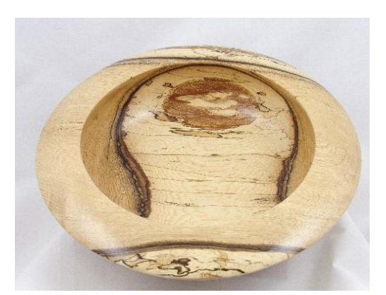
Jeff Lohr, Hickory, , Polyurethane, 14"