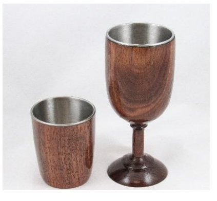
Cody Walker, System 3 Epoxy, Stainless Steel & Walnut Cups, 8" X 4"