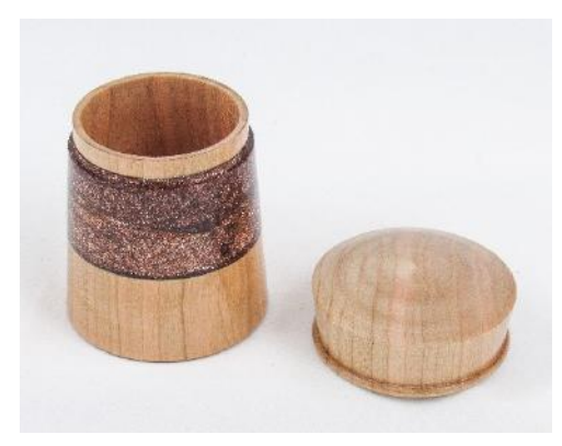
Tim Warren, Cherry, Myland's Friction Finish, 2.5" X 3.5"