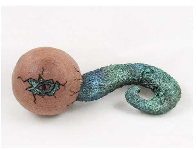
Greg Glennon, Walnut, Air Brush, 7" X 2.5", Kraken Egg