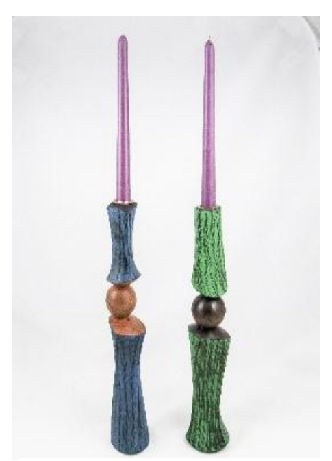
Barbara Dill, Walnut & Cherry, Oil & Milk Paint, 14", Features Multi-Axis