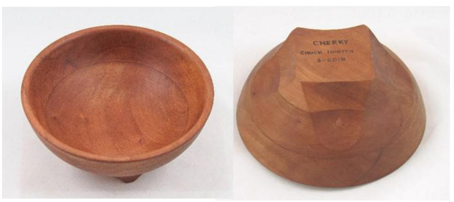
Chuck Horton, Cherry, No Finish, 5"dia X 3"h, Experimental Turning