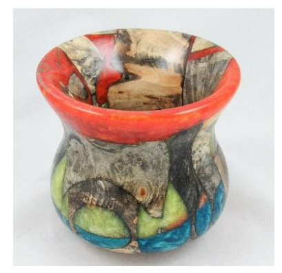
Gordon Kendrick, Unknown Species, Spray Shellac, 5" X 8"t, Burl Pcs & Epoxy