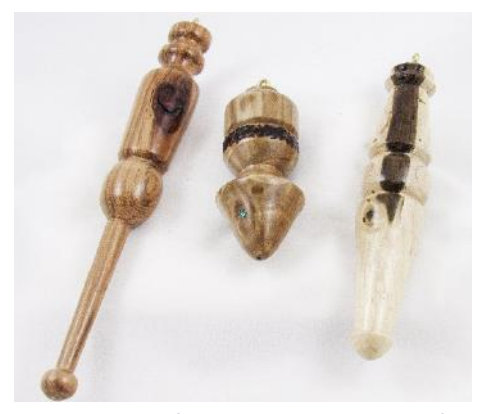
Sherry Neff, Oak & Unknown, Deft Lacquer, 9"/ 4"/6", Wormy Wood with inlay and Wood Burning