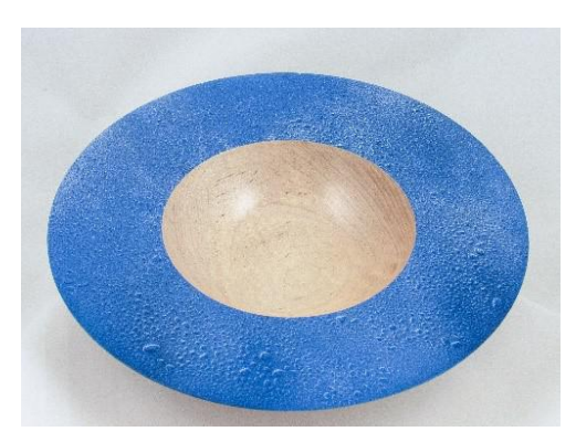
Bob Silkensen, Maple, Water Drop Paint, 10¼" X 2"