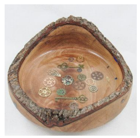
Georgia Wood, Walnut, Yorkshire Grit & Shine Juice, 10" X 2", An Experiment in Resin & Trinkets