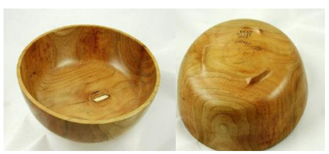
Brad Miller, Cherry, Wax, 10 X 3