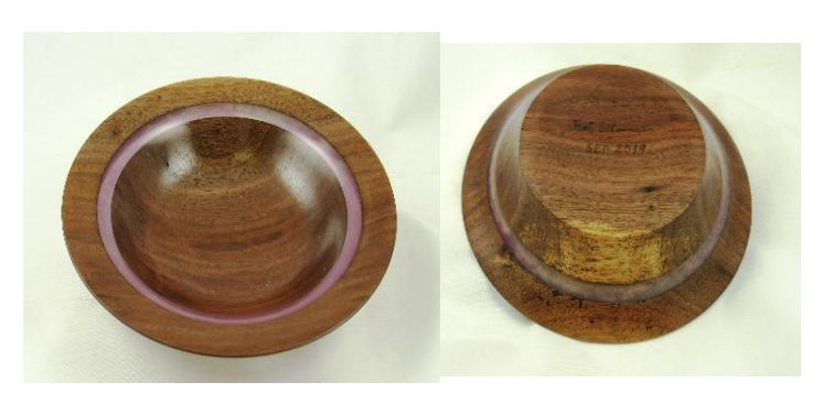
Bob Silkensen, Walnut, Hampshire Shine, Resin Filled, 111/2