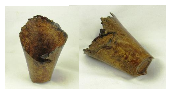
Robert Gundel, Maple Burl, Buffed and Waxed, 5 X 7