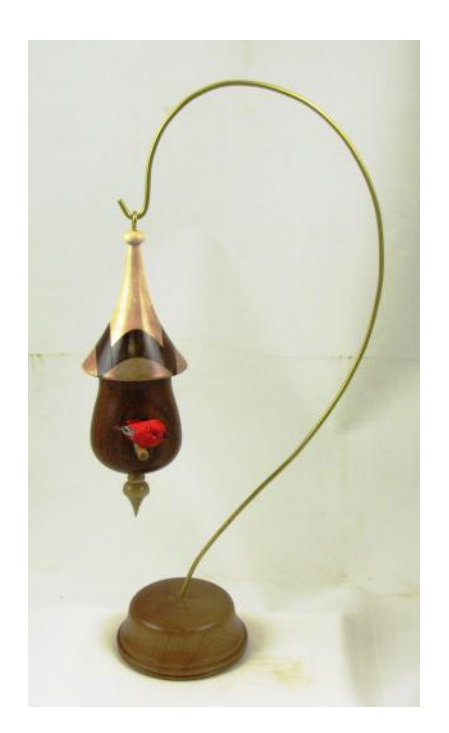
Tim Warren, Black Mesquite, Maple, Birch, & Cherry, Lacquer, 5 X 2