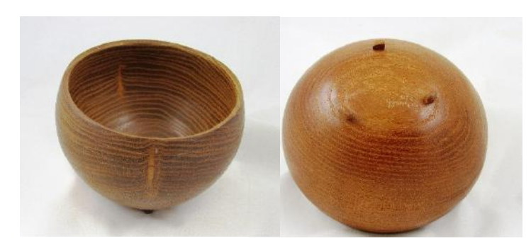
Steve Schwartz, Osage Orange, Poly, 6 X 4½