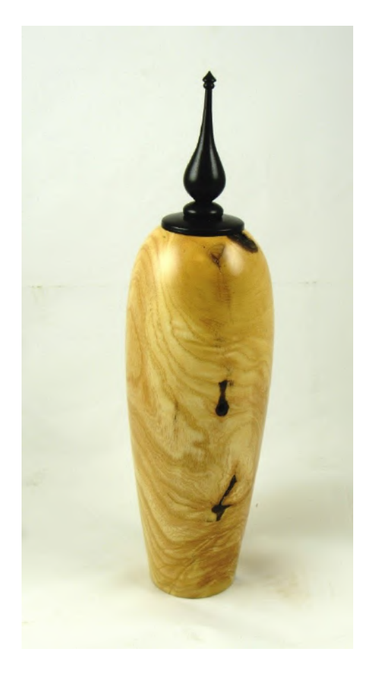
Robert Gundel, Ash/African Black Wood, Buffed and Waxed, 9 X 3 & 2 X 3½