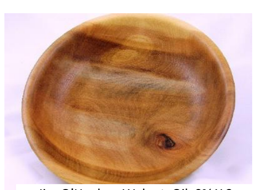
Jim O'Hanlon, Walnut, Oil, 9¾ X 2