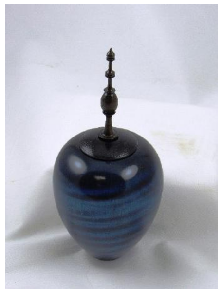
Dick Hines, curly Maple, Lacquer, 3½ X 4 and 2 X 3