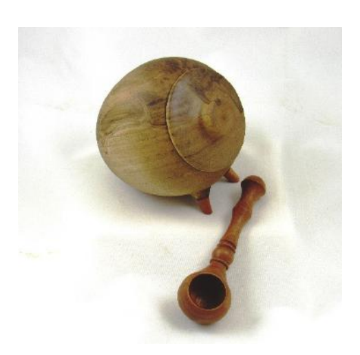
Jim Bumpas, Unknown Species, Bees Wax & Mineral Oil, Salt Pig /Tea Box