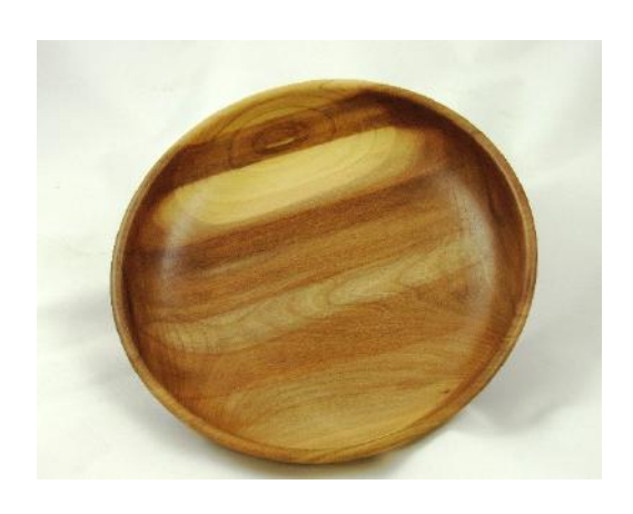
Jim O'Hanlon, Walnut, Oil, 8¾ X 2