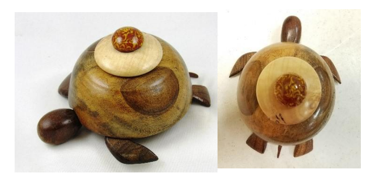
Chuck Moser, Maple & Walnut, Lacquer, With Glass by Lisa, 4 X 3