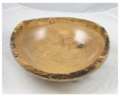
Steve Kellner, White Oak, Varnish, 12" X 5" Once turned, hope it does not crack