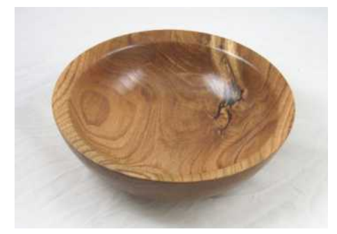
Chuck Horton, Oak, Wipe-on-Poly & Buffed, 10½" X 3½"