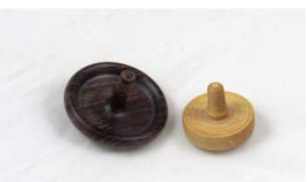
Jim Bumpas, 2 Spinning Tops