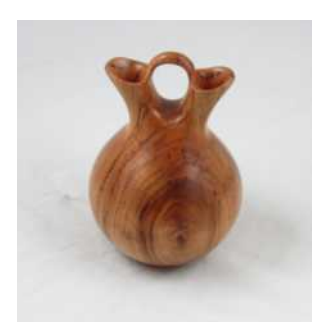
Cody Walker, Black Cherry, Wipe-on-Poly, 6" X 4", Wedding Vessel