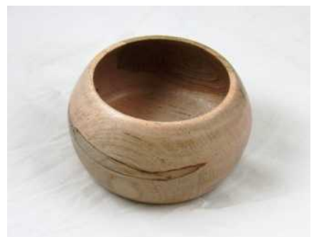
Bob Marchese, Ambrosia Maple, Waxed and Buffed, 6" X 6"