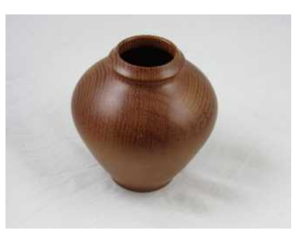
Steve Schwartz, Osage Orange, Wipeon-Poly, 7" X 6", Was Lemon-Yellow when turned