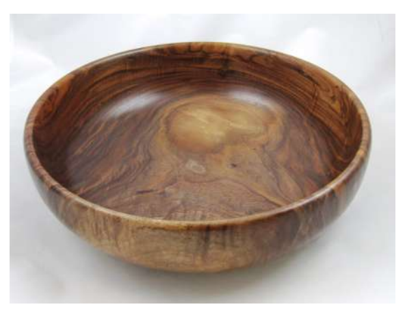
Amos Peterson, Black Walnut, Salad Bowl Finish, 16" X 5"