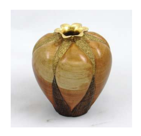
Ron Bishop, Cherry, Oil, 6 X 6,