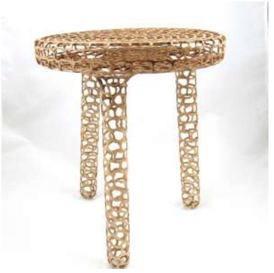
Dan Luttrell, Maple, Lacquer, 10" X 12", Pierced, Hollow, 3 -Legged Stool