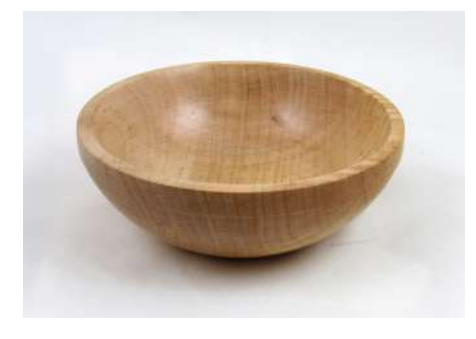
Lee Scarbrough, Maple, Deft, 3" X 6"