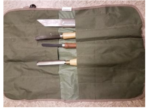
Two sets of tools