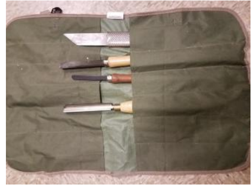
Two sets of tools