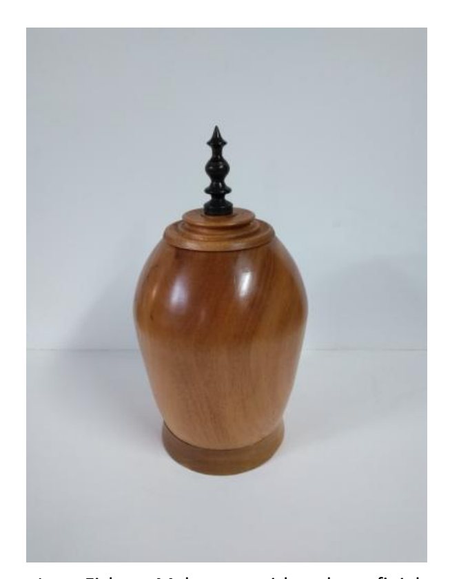
Jerry Fisher - Mahogany with a ebony finial and the top and bottom are Cherry. The finish is Poly. The mahogany was from Avlinos' class but I blew through the bottom and couldn't do the carving on it. Thus the cherry top and bottom.