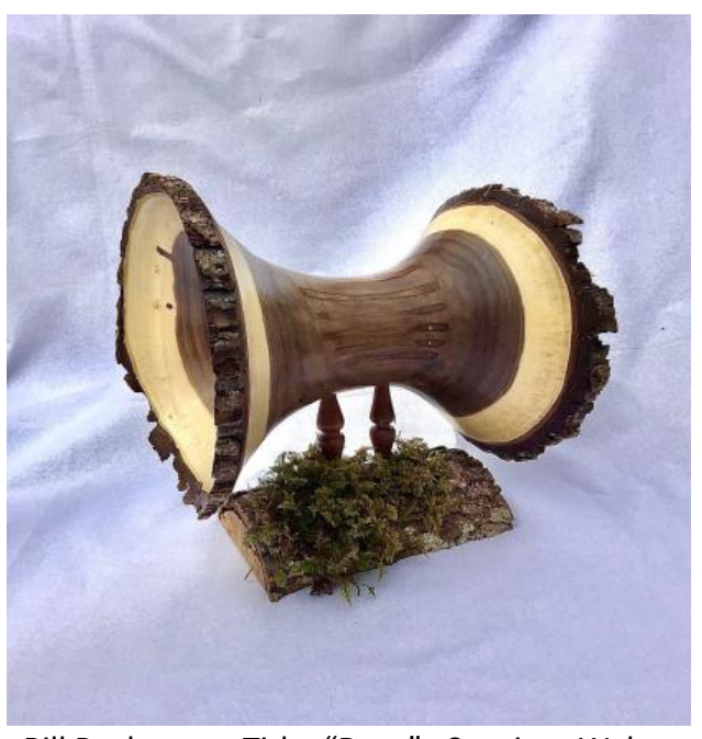
Bill Buchanan - Title: "Duet", Species: Walnut - Finish: Danish Oil, Size: 11 x 9"