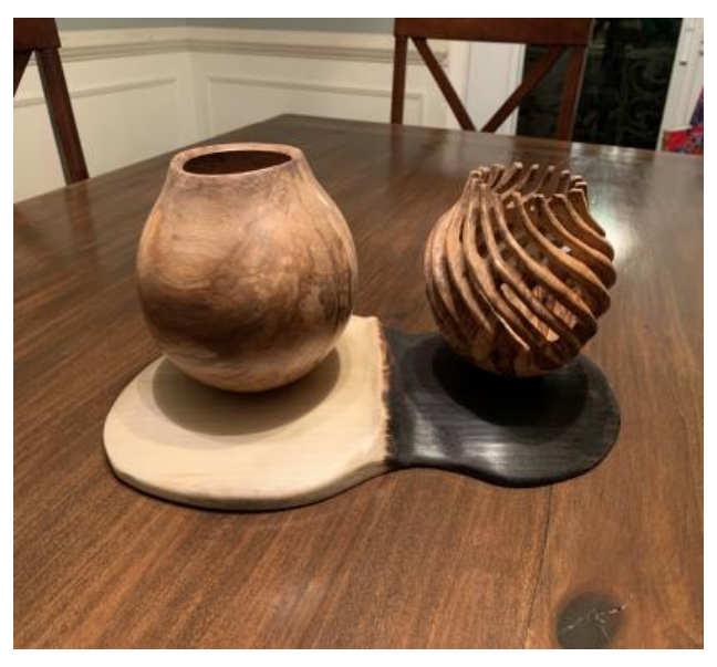
Greg Glennon - Sculpture piece titled "Reflections of the Soul"