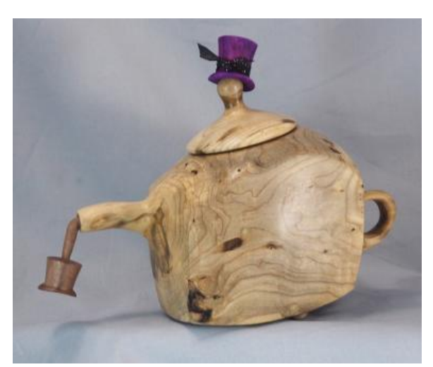
Cody Walker - Magnolia and walnut, Satin WOP, Turned on six axis and off center, Roughly 7" tall to top of the hat