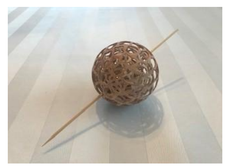
Dan Luttrell, "Not Quite Chinese Balls", 9 layers, various woods, 3-1/4" dia