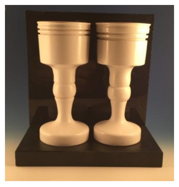
Bruce Robbins - Maple with white acrylic paint, Title: The invisible violin (in the negative space)