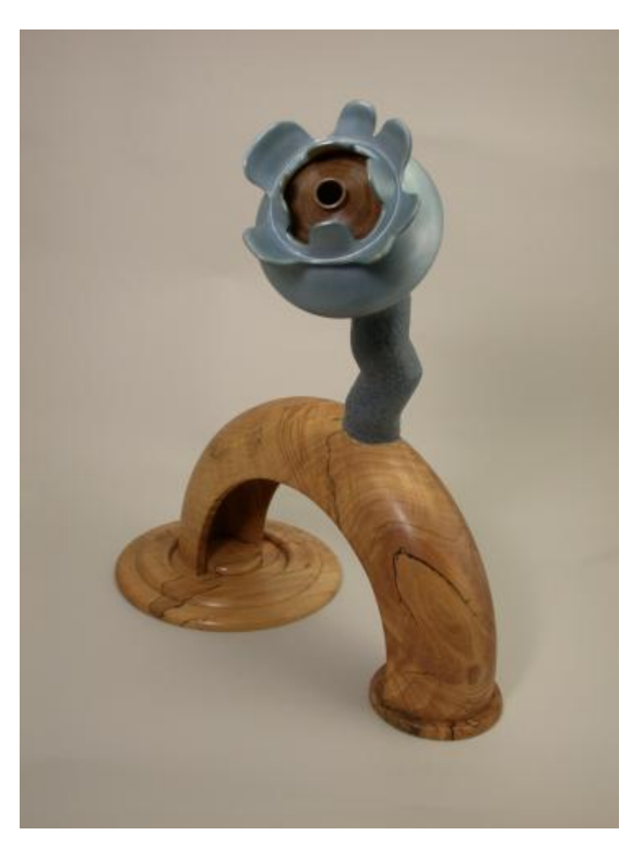
Chuck Mosser - Title is "Blue Fantasy", Wood Is spalted maple, boxwood and walnut, Other materials are textured paint and gilders paste, Finish is gilders paste, textured paint, oil