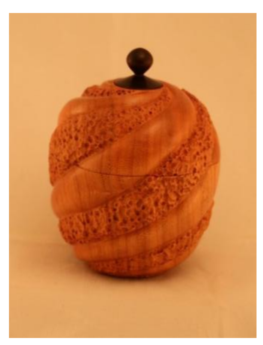
Ron Bishop, One more, a functional lidded vessel, Cherry and Mexican Brown Wood, 4" tall X 3", Liberon wiping oil.