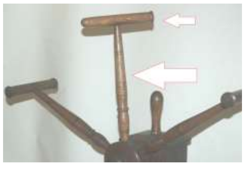
Walt Connerm. my first-ever project, I have pointed at the replacement spindle for a friend's yarn winder, 13" long and 1 1/4" in diameter