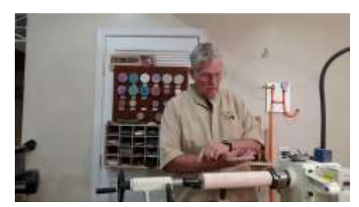
Then put a tenon on one end, mount in a 4 jaw chuck.