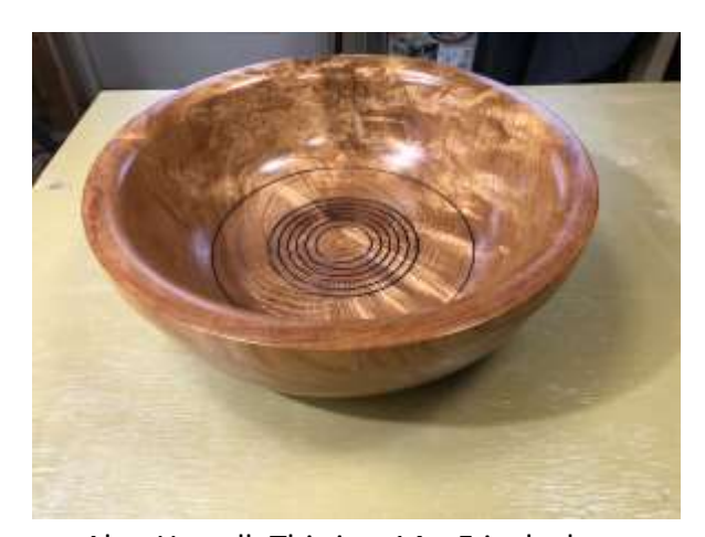
Alan Harrell, This is a 14 x 5 inch cherry bowl with tung oil finish