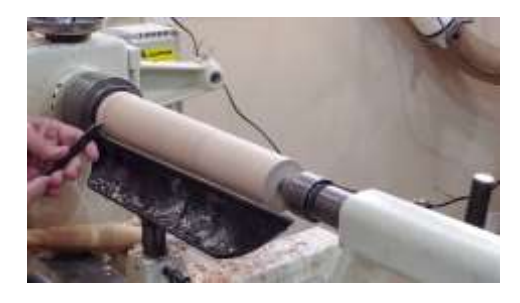
Mark out the waste at the chuck end, with a parting tool mark out the diameter of the top (2") and the bottom (2.5"), and mark 1/3 from the top.