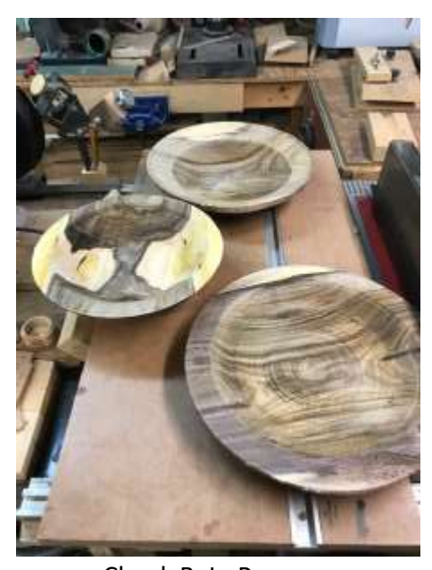
Chuck B, In Progress