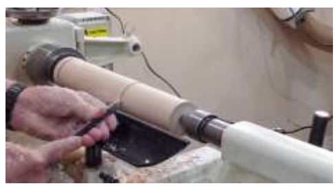
Part deeper into the skinny part (not all the way) but will eventually be 1/4" diameter and blend in the taper with a spindle roughing gouge or a regular spindle gouge.