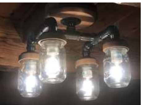
Cody Walker, Redneck Chandelier- five turned elements, stained Maple