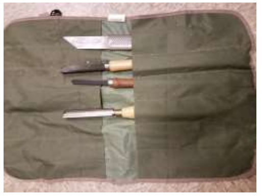
Two sets of tools