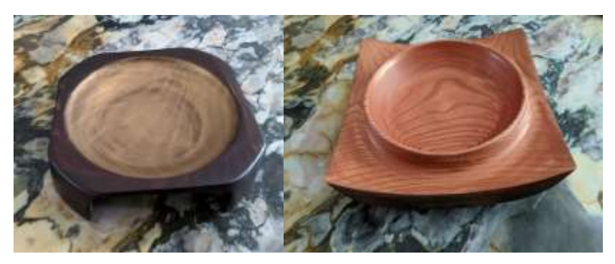
Jerry Harvey, The brown one is dyed Silver Maple, four legs turned in the turning process. Gold wax guild in the top, 8" X 8". The other is Ash, 10" X 10" colored with copper kettle metallic luster wax. Both finished with Yorkshire grit before wax.