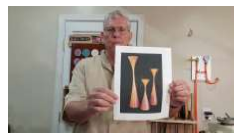
Candleholder has the general form of 1/3 top, 2/3 bottom and the diameter is 2" top and 2.5" bottom. There is also a 1" waste at the bottom.