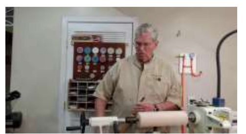
use the roughing gouge to round up the blank between centers.