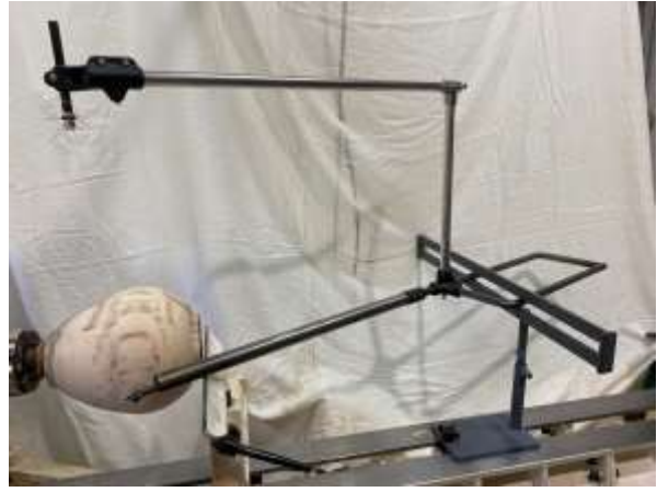
Jamieson Hollowing Rig, As Set Up and in Use