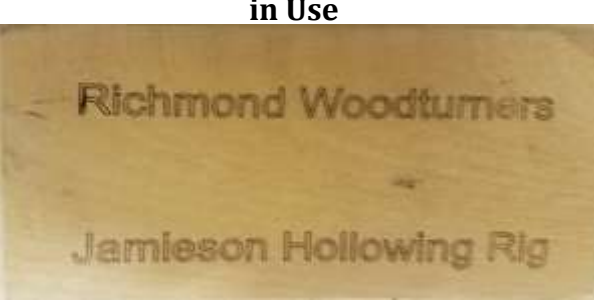
Jamieson Hollowing Rig - Stored in large Box in Cabinet