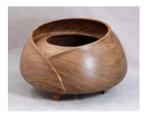
Dave Bushman, It is black walnut with a wipe on poly finish