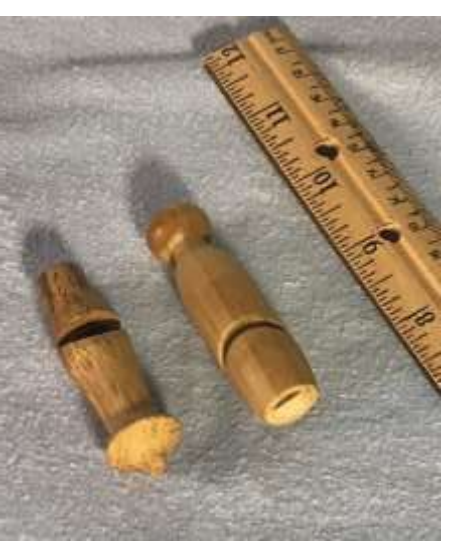
Chuck Horton,. Quarterly challenge, musical instrument, whistles, Mango and maple.

Steve Kellner, The challenge instrument is a Kalimba thumb piano. Turned from Sycamore branch finished with pure linseed oil at present, but plan to varnish after completely dried and crosslinked. Still working to fine tune the 'Piano' keys. Dimensions: 8" x 7.25" diameters (from drying) x 3.25 tall. Sounding board 1/8" thick. Shown with and without 'keys' attached. Note, the keys are still a work in progress.