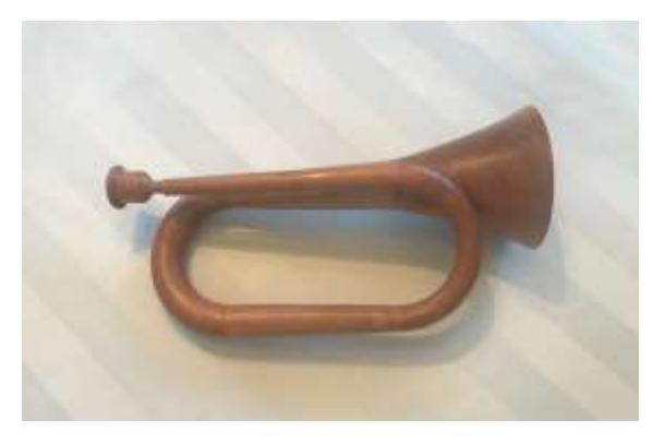
Dan Luttrell, Bugle size, Cherry, 7-1/2" dia x 11-1/2" long

4th Quarter Challenge Musical Instrument or Item to Create Tones.