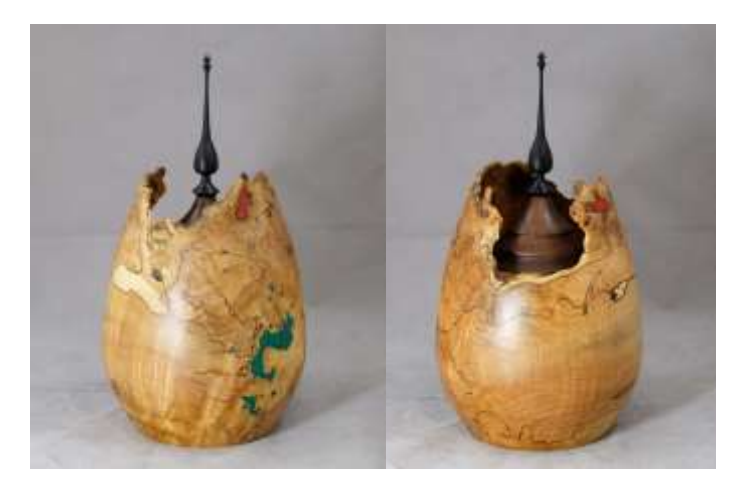
David Bushman, Here are two photos of my best work of the year. It is a lidded vessel with a spalted Norway maple burl body. The ring and lid are black walnut and the finial is ebony. It also has malachite and synthetic red coral inlays. The finish is wipe on poly.