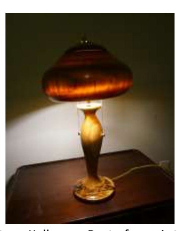
Steve Kellner Best of year is the poplar and WO lamp I finished in the spring. Pedestal and shade are Poplar; base and cap are spalted white oak. Shade is 12" d x 5" h, pedestal is turned on 120 deg offset axis and is 3" x 12", base is 6" d x 2" h. overall height of lamp is 23". Lamps is finished in Table top Rock hard varnish