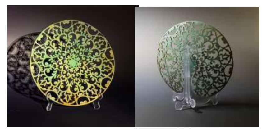
Luigi D'Amato, Two views of latest piercing work, Plate 25 cm, Piercing and metallic paint