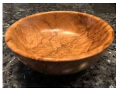
Jim O'Hanlon, Burl (unknown species) 5" x 2"