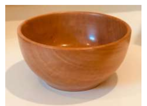
Jim O'Hanlon, Pear bowl 7" x 3.5"

Both bowls we're finished with bee's wax (applied and buffed on the lathe).