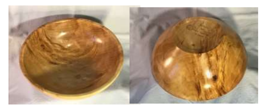
Chuck Horton, Turning of the year: Beech, largest part of a cored blank, 11" x 4", finish - wipe on poly, sanded to 400 grit.