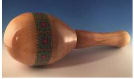
Bruce Robbins, Maple with Polymer Clay embellishment