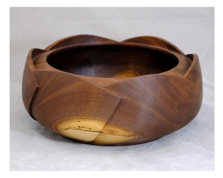
DAVID BUSHMAN: BLACK WALNUT TURNED AND CARVED, 9 1/2" x 4" TALL. THE FINISH IS MAHONEY'S WALNUT OIL