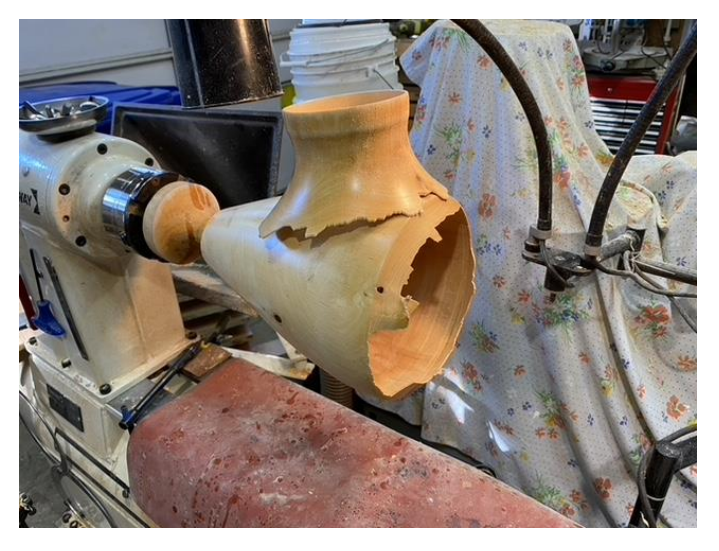
RAY DEYO: BIRCH HOLLOW FORM, WHAT HAPPENS IF YOU REVERSE TURN WITHOUT SECURING THE CHUCK