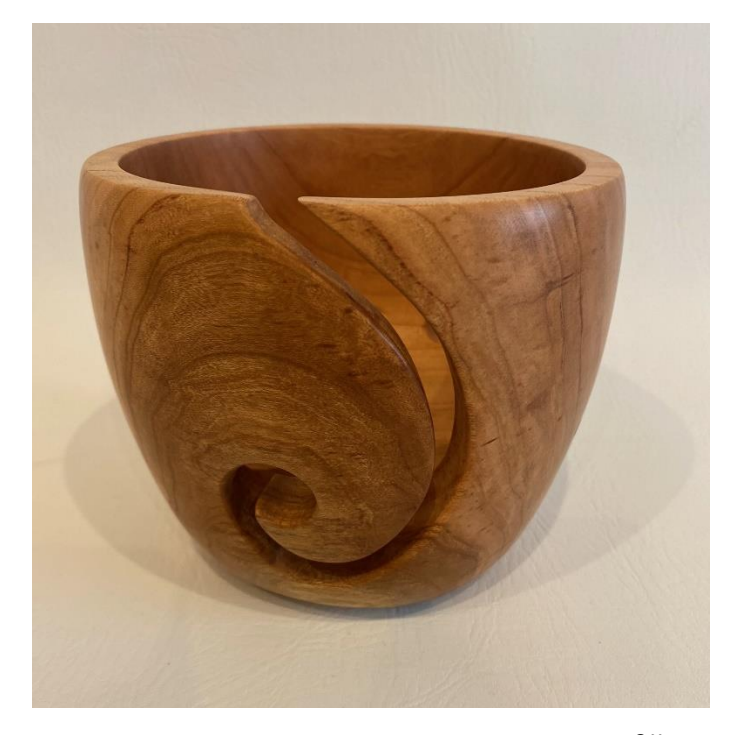
CHUCK BAJNAI: YARN BOWL, CHERRY ABOUT 9" IN DIAMETER, FINISH IS WALRUS WAX