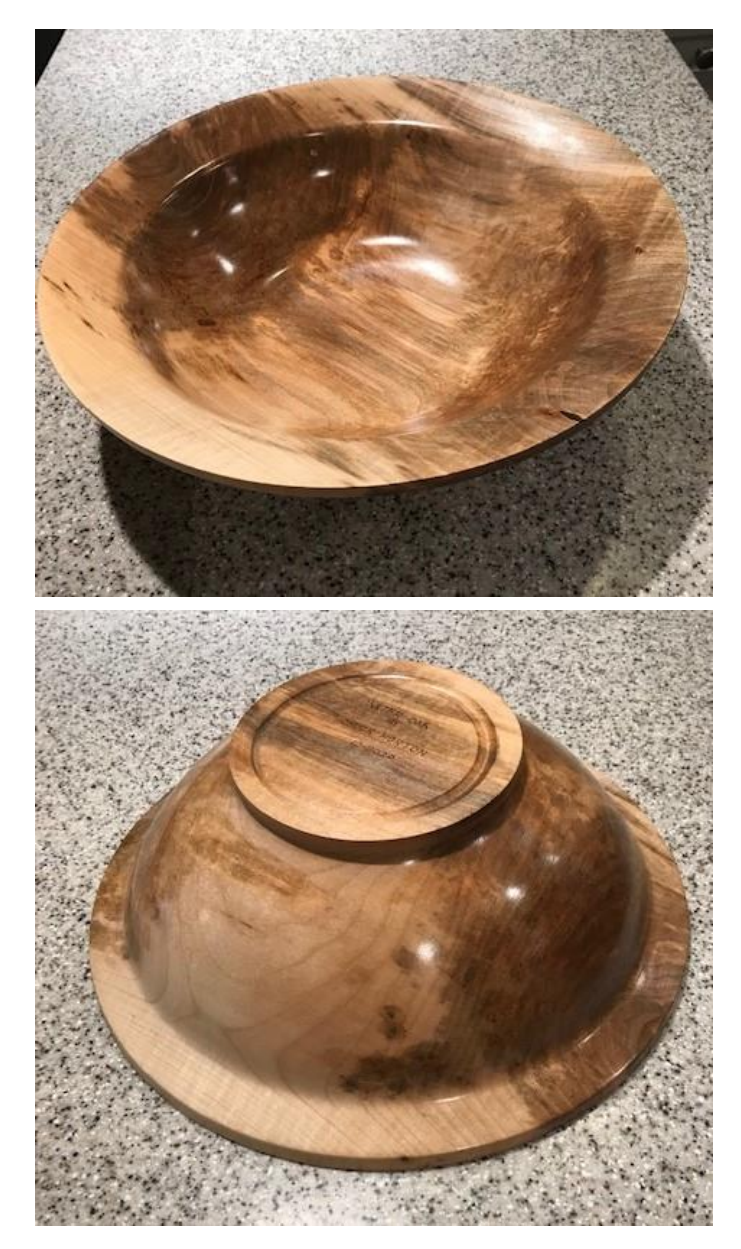
\begin{array}{l} \mbox{chuck horton: Water Oak, 13" x 4", finished with several coats of minwax antique oil } \end{array} \\