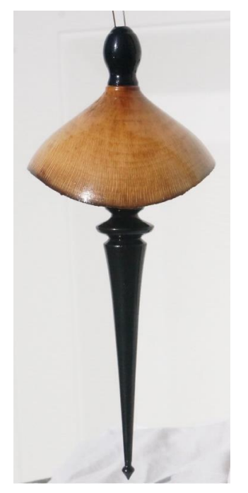
Steve Kellner:3"x 7" Umbrella ornament, sycamore and ebony, table top varnish.