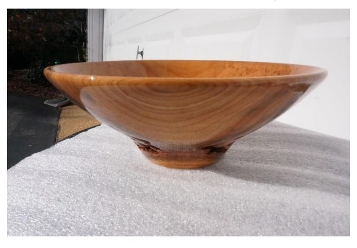
STEVE KELNER: 4"X 9" WORMY CHERRY BOWL, TABLE TOP VARNISH, SIDE VIEW