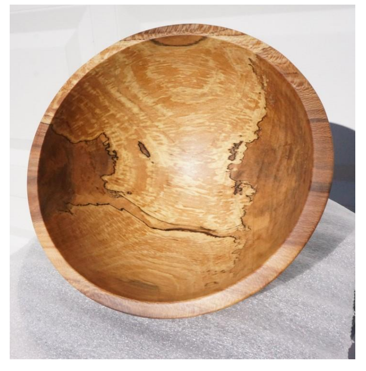
STEVE KELLNER: SPALTED SYCAMORE BOWL, TOP VIEW