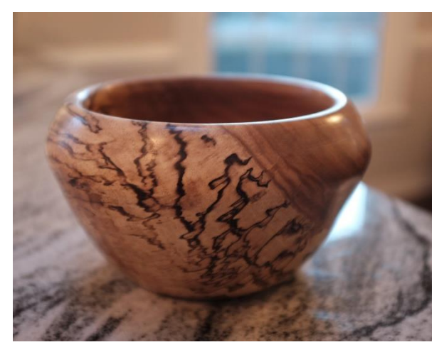
CHRISTOPHER WAGGENER: SPALTED CHERRY BOWL FINISHED WITH A FRICTION POLISH