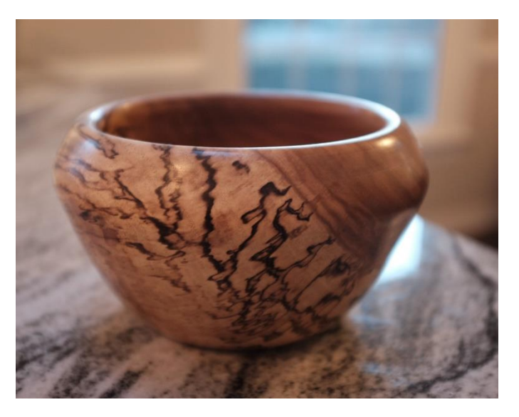
CHRISTOPHER WAGGENER: SPALTED CHERRY BOWL FINISHED WITH A FRICTION POLISH