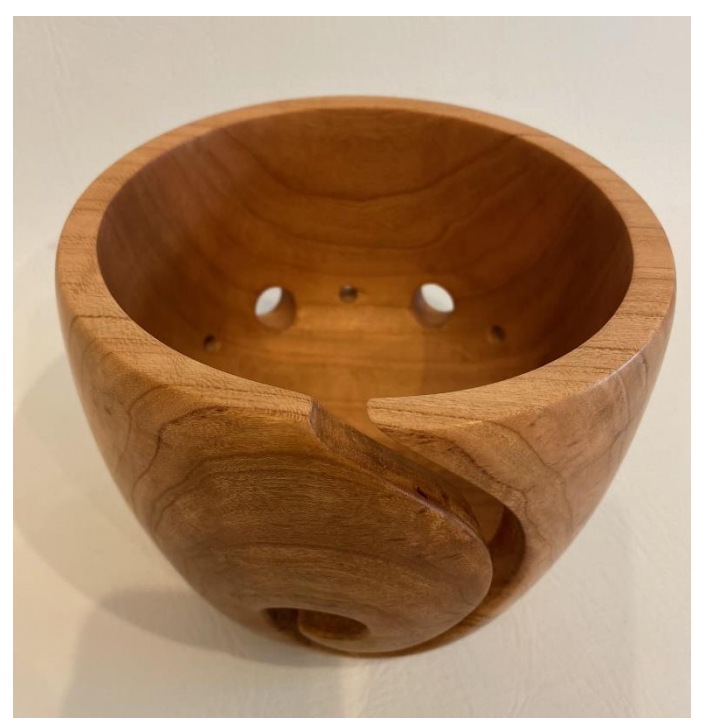
CHUCK BAJNAI: YARN BOWL ABOUT 9" IN DIAMETER, CHERRY, FINISH IS WALRUS WAX