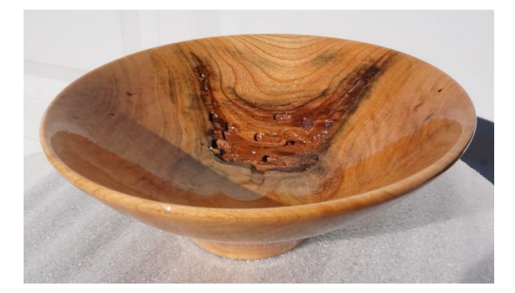
STEVE KELNER: 4"X 9" WORMY CHERRY BOWL, TABLE TOP VARNISH, TOP VIEW