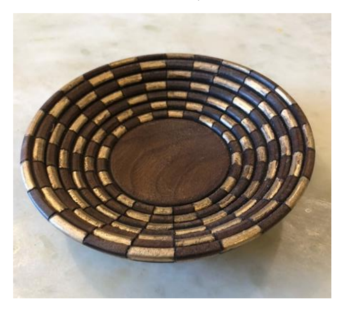
Alan Harrell: 6" walnut basket illusion.

in diameter and 7" tall. The finish is polyurethane. (Search the internet for "Nantucket lightship basket mold" for more information.)