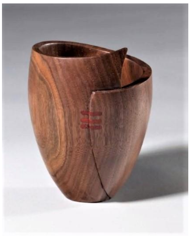
This piece had a rim crack. It was carved to look wrapped around and the splines added to make it appear that the piece was actually wrapped.