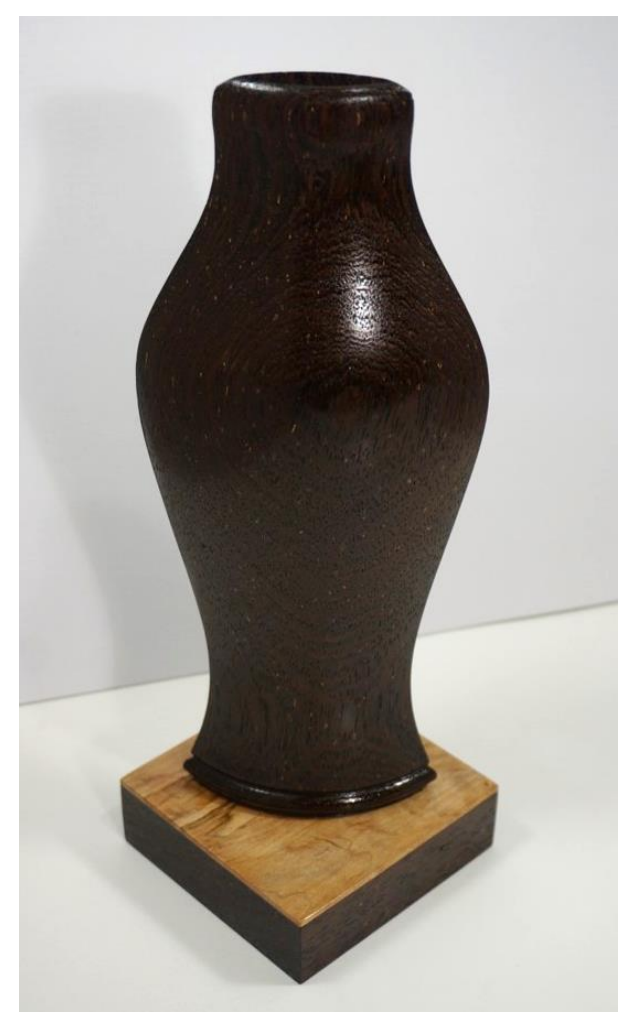
Steve Kellner: wenge hollow-form bud vase on wenge base with maple veneer, 11"x 5"x 2"