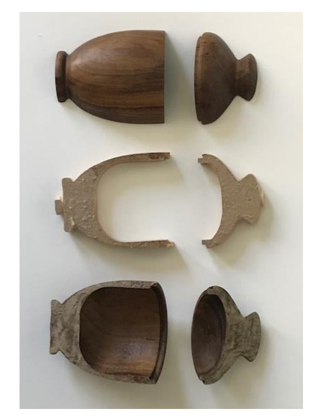
Chuck Horton: Koa piece before reassembly. Lost wood was ½" maple.