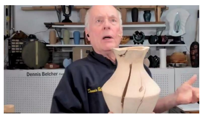
Question: How many ways can you deal with a crack?