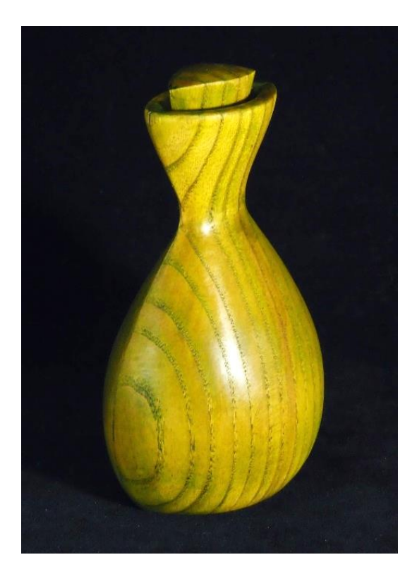
Cody Walker: Lost Wood perfume bottle, Ash approximately 6" tall.