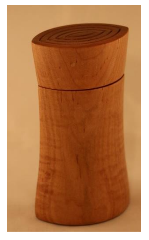
Ron Bishop: cherry, finished with Liberon finishing oil, 7" \times 3"