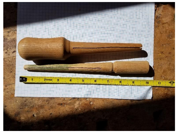
From Robert Marchese: These are fids and I use them to hold sandpaper for various shaped turnings