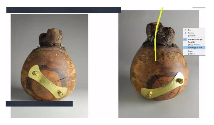
This hollow form was decorated with a hammered brass plate and bolts