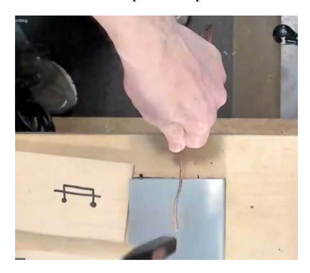
Make staples with 12 or 14 gauge copper wire. Be sure to use a hard and smooth surface to get smooth staples.