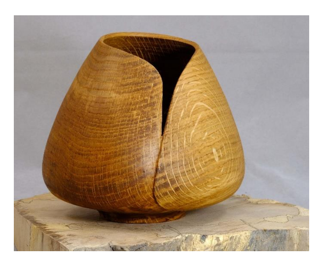
David Bushman: white oak with a walnut oil finish.