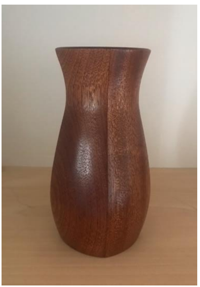
Dan Lutrell: hollowform, mahogany, about 7" tall