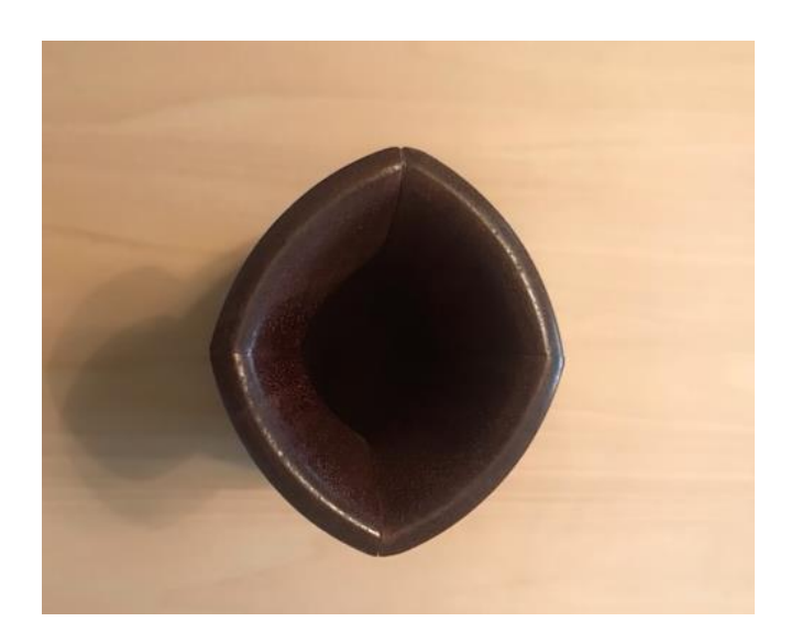
Dan Lutrell: hollowform