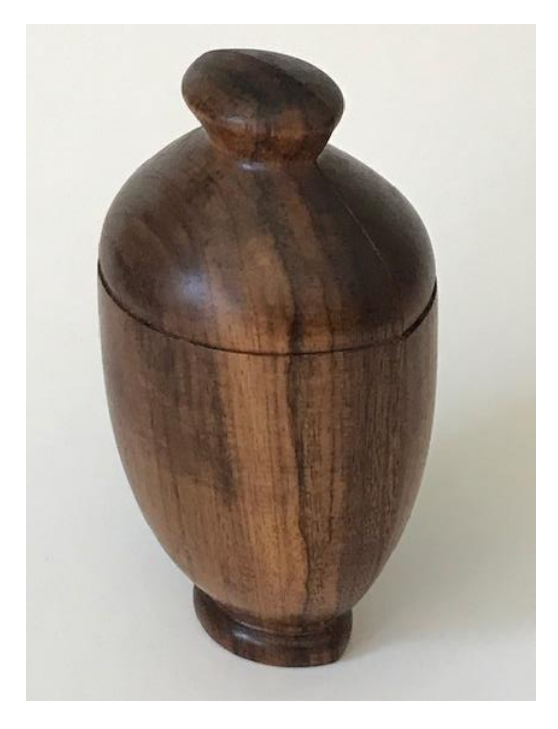
Chuck Horton: koa, 5'' \times 3'' \times 2\frac{1}{4} ", finished with wipe on poly