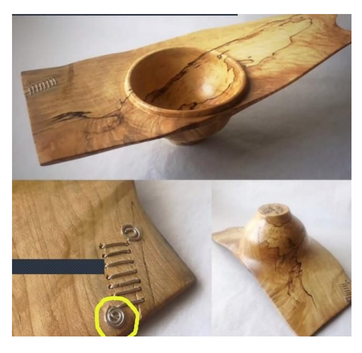
Here are two examples of staples.