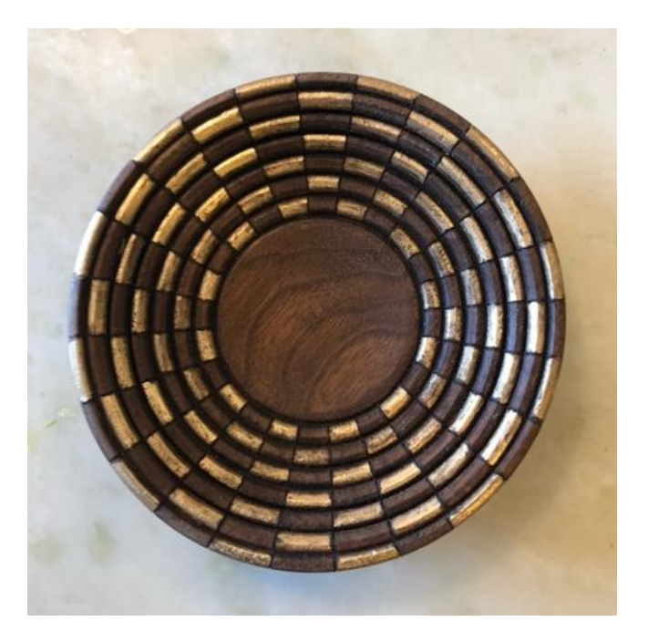
Alan Harrell: 6" walnut basket illusion