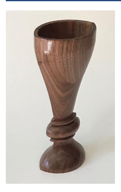
Chuck Horton: walnut glue-up. It is meant to copy a vase I saw at a Rooms to Go store. 8" x 3 ½" x 2 ¾"