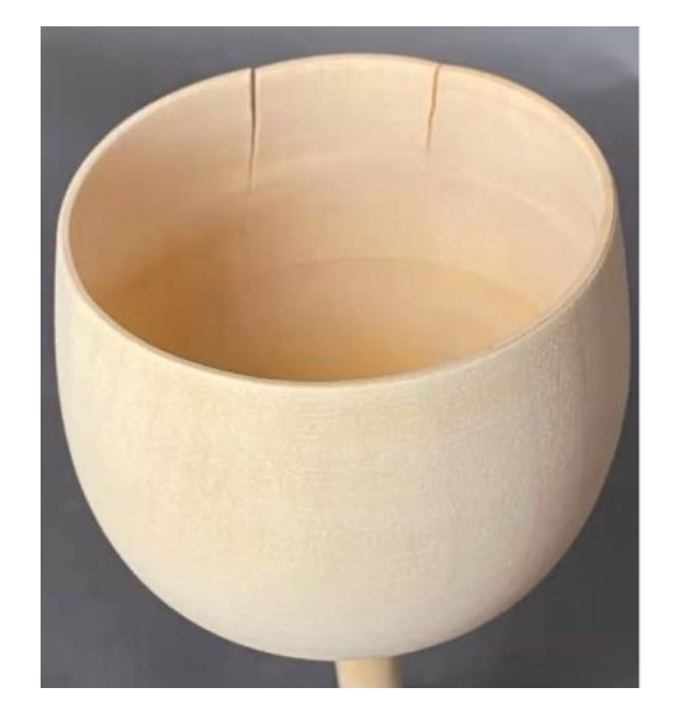
This cracked goblet was used to stimulate discussion as to how to treat the crack. Some options were: (a)