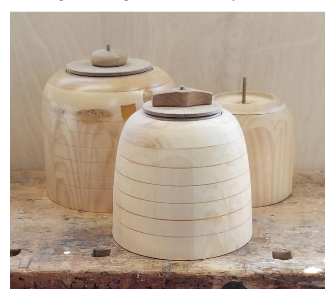
Robert Marchese: Nantucket Lightship Basket mold, in the foreground, with two older ones; it measures 8"

Robert Marchese: Eastern red cedar bowl, finished with edible mineral oil, 2.75" x 5.75". The blank was from a dead tree cut down 8 years ago. The pith and several growth rings had rotted away.