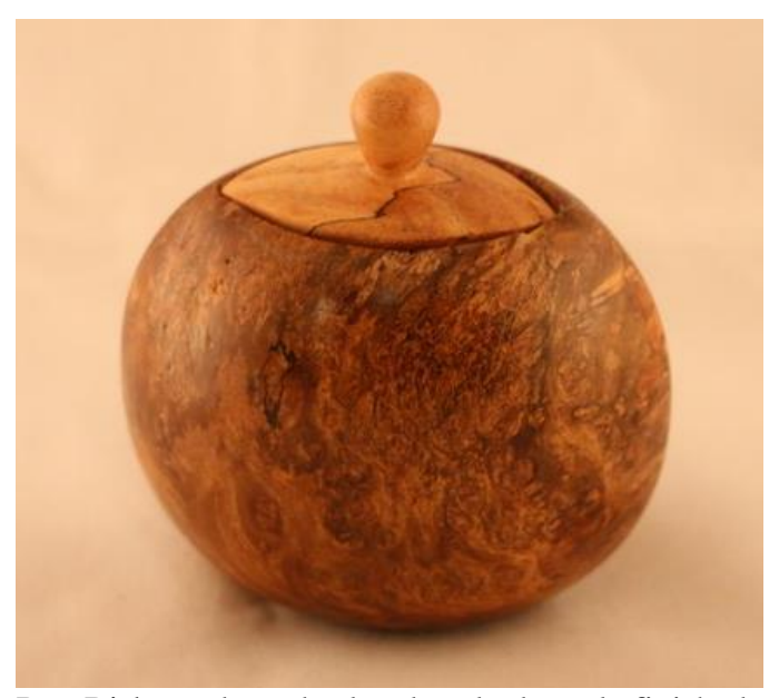
Ron Bishop: ebony burl and spalted maple finished with Liberon finishing oil, 4" x 3"