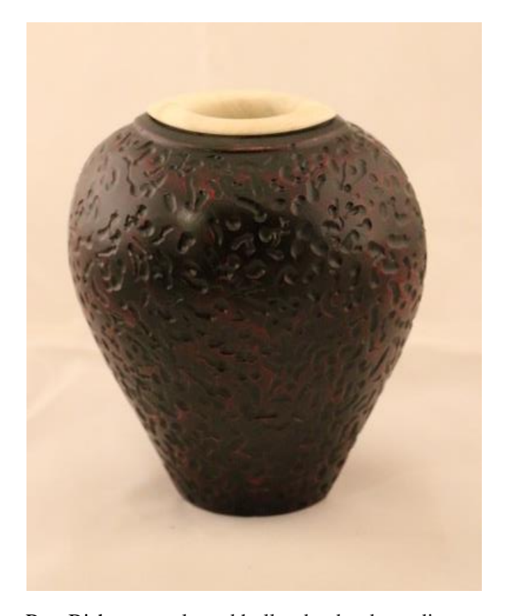
Ron Bishop: maple and holly. dyed red, sanding sealer then black dye, top coat, Deft semi-gloss lacquer, 7" x 5"