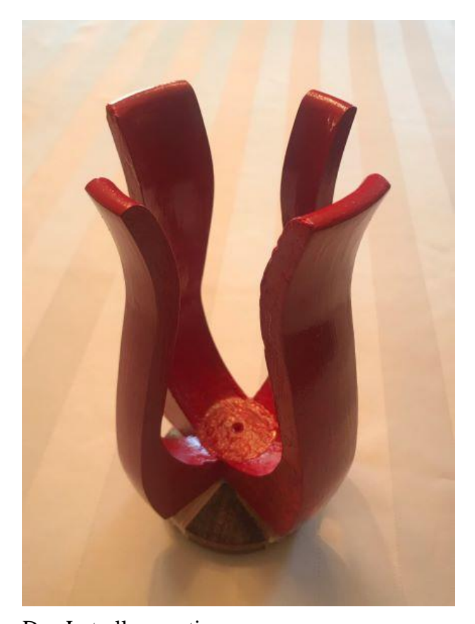
Dan Lutrell: negative space