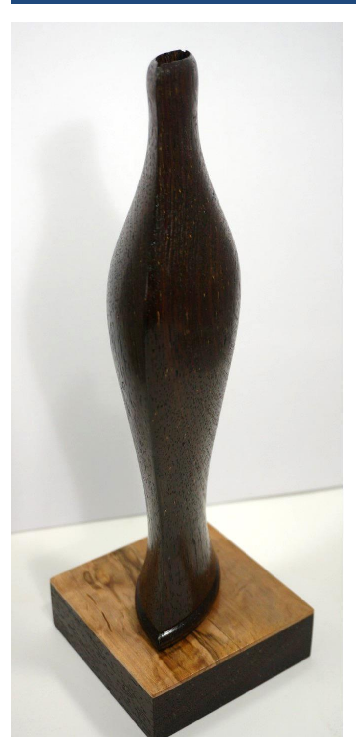
Steve Kellner: same wenge vase on 4" x 1" base, shellac finish