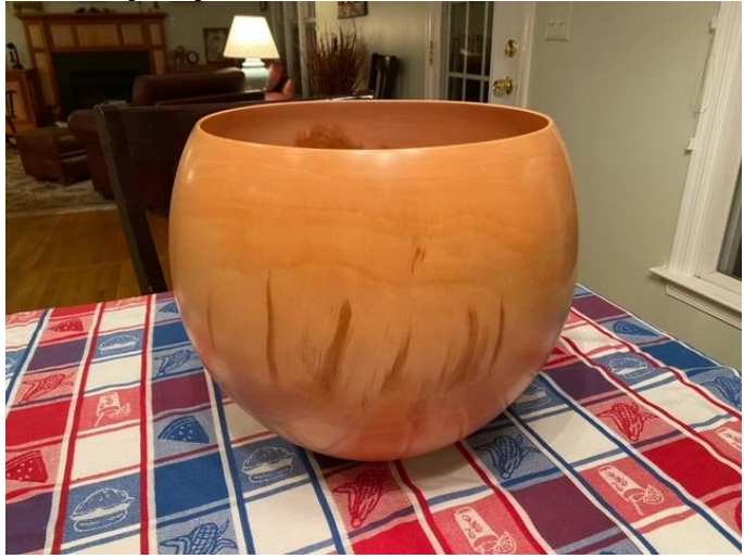
This is a bradford pear bowl 13" wide, 14" tall, with Oil urethane finish.