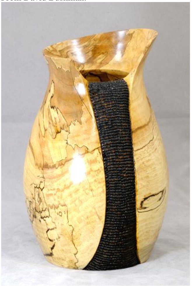
This is from a spalted beech burl. It is 9" tall and 6" in diameter. The finish is GF Woodturners Finish.