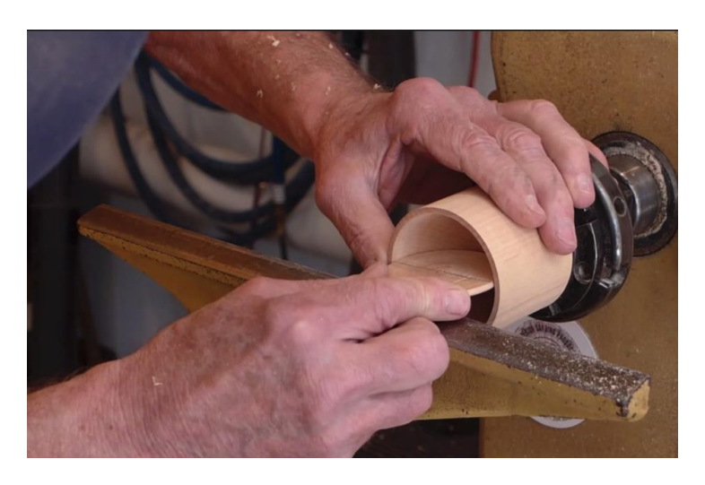
The internal sphere is perfect when the diameter line of the circle gauge exactly matches the edge of the work piece and there are no gaps or humps on the inside.