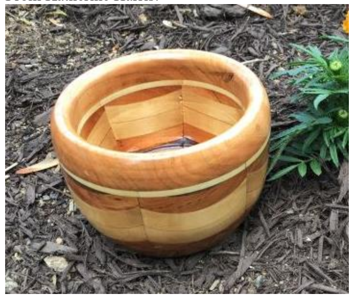
This is a segmented pattern that took her forever to figure out. It is cherry, walnut, and maple.