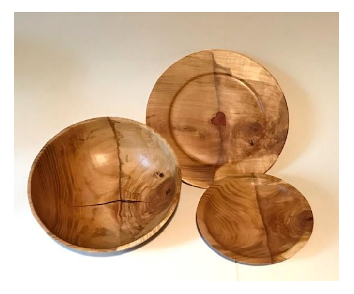
Set of cored beech. Platter 11" x 1", large bowl 10" x 3 ½", small bowl 7" x 2 ½". Finished with Minwax wipe-on poly.