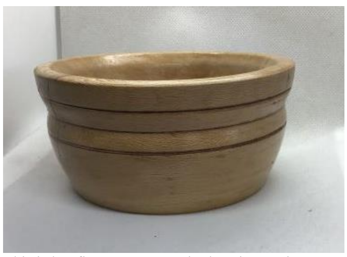
This is her first attempt at wire burning. It is mystery wood.