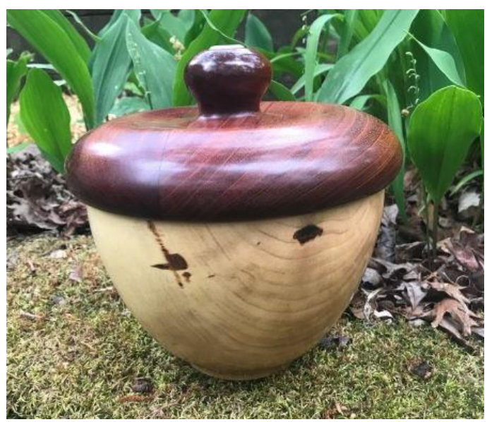
This is a Beads of Courage box. It is 8" x 8". The base is gum and the lid is walnut, with a Danish Oil finish.

Here are two bowls, ash, 9" x 2.5", turned green and finished with Danish Oil. They are made from a small piece of log. He had to split around a wire fence that was embedded about 20 years ago. He still has the other half of a large log that has been cored and is drying.