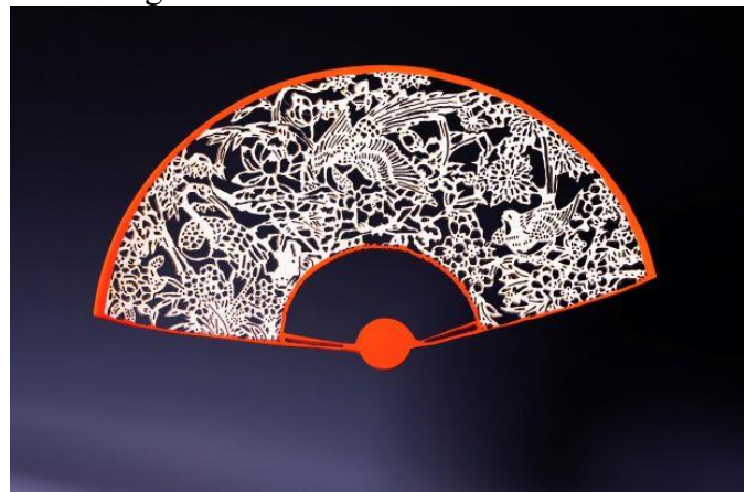
The wood is maple, the red is acrylic. The pattern represents a jungle. The width is 22 cm (8.6"). Editor's note: Enlarge this on your screen to appreciate the detail!