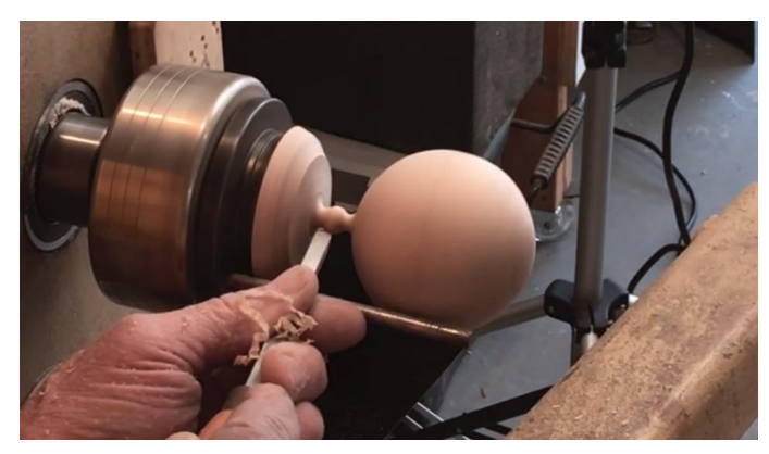
Be careful parting off. Leave a ligament and sand off the nub.