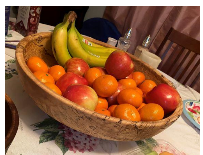
This is spalted maple, her first twice-turned bowl. It is finished with Mahone's oil and polishing wax, then sealed with 4 coats of Mod Podge dishwasher safe sealer.