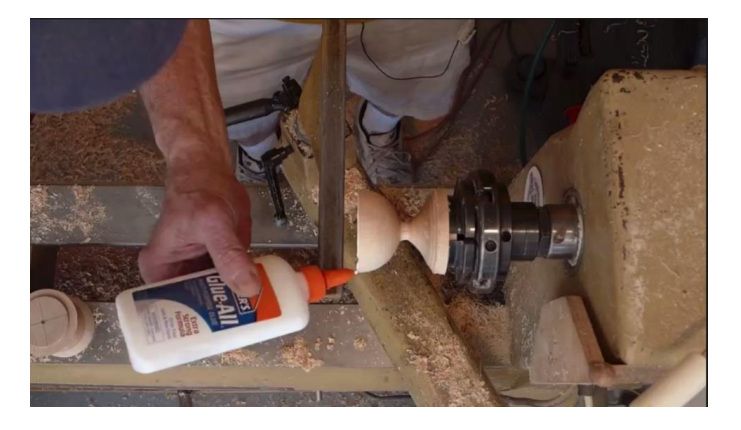
This is a complete hemisphere, ready for gluing to another hemisphere. Wall thickness is 1/16'' \pm ...