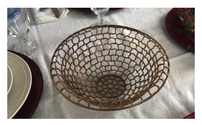
Here is a regular turned bowl after piercing. Piercing is a good way to remove a lot of tearout.