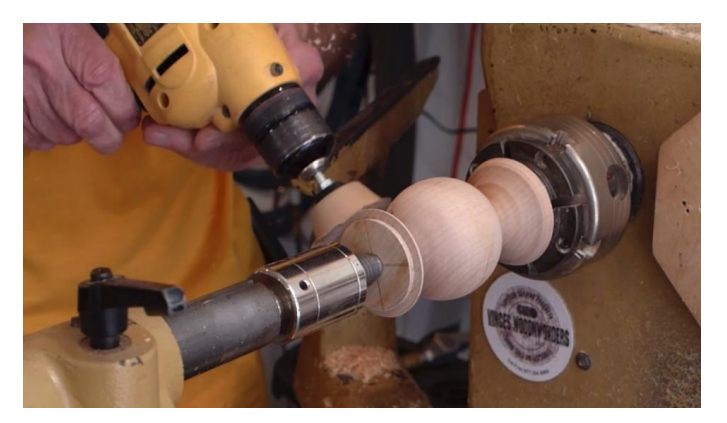
Two hemispheres glued together and final sanding in progress.