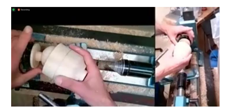
Testing the fit of the jamb chuck with the spout in the drilled hole.

Make a jamb chuck sized to fit the diameter of your salt shaker blank. Start with a block about 4 ½" square and 5" long. Turn it round between centers and make a tenon on the spindle end, sized to fit your chuck of choice. Remount it with the tenon and hollow enough to fit the salt shaker blank. Then drill a hole in the jamb chuck that is 3/8" or slightly larger. The angle of the hole from the centerline of the lathe spindle should be between 25° and 35°. This angle determines how the completed salt cellar will sit on the table. The hole must be sized to fit the "spout" on the salt shaker workpiece.