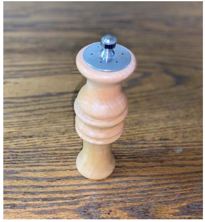
From Jim Zorn: 7" Salt or pepper grinder. Maple with poly finish.