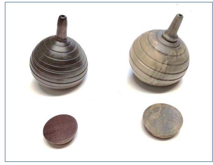
From Steve Kellner: wacky salt and pepper shakers. 2.5" dia., walnut (L) and light spalted wood (R). The finish is tung oil and carnuba wax.