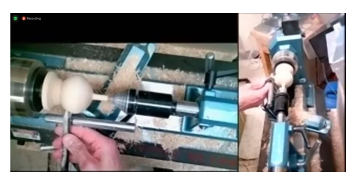
Refine the shape and turn down the spout to 3/8".

The starting shape, spindle orientation. For the salt shaker, use a hardwood, about 2 ½" square (or round dowel) and about 4" long. Before turning the "spout" to final dimension, drill a 1/8" hole in the spout. This is how the salt will be dispensed. This will minimize the likelihood of splitting the spout while drilling it. You can use a hand-held drill bit in a holder or a hold the bit in a Jacob"s chuck.