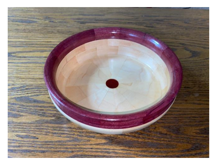
From Jim Zorn: segmented 3" x 11" maple and purpleheart bowl, finished with poly.