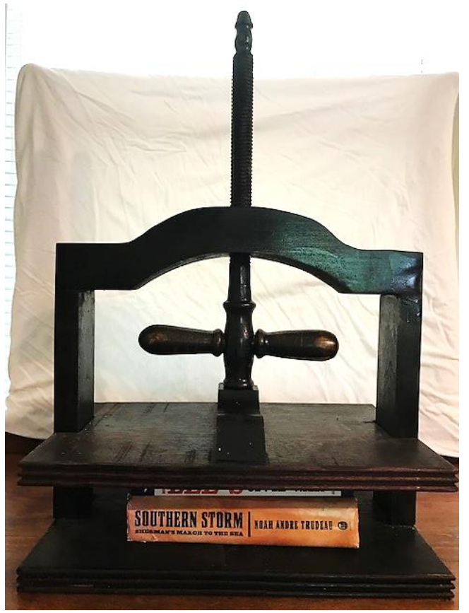
Gordon Kendrick: early 19th century style book press, 16" wide x 10"deep by 24" high, made from beech, soft maple, white oak, hickory, walnut and purple heart.