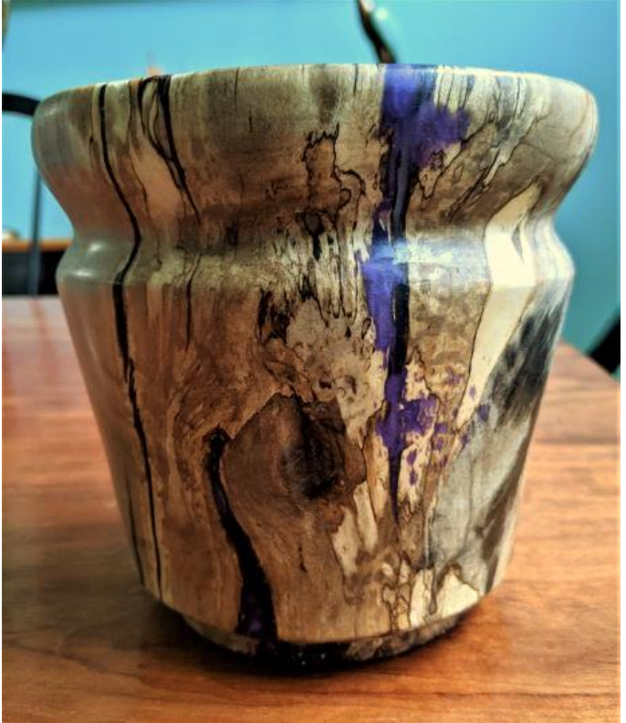
From Jerry Harvey: Old spalted, partly dry rotted log found in my vacant lot and filled in with epoxy resin. The finish is Yorkshire grit, Myland sealer and friction polish.