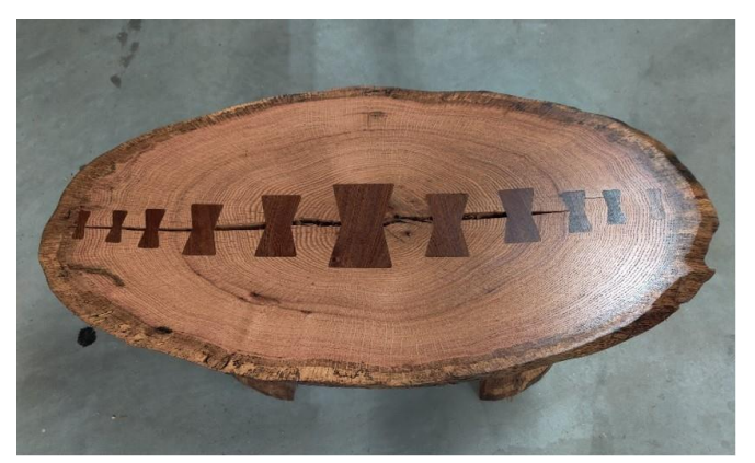
It is 15" x 30" x 16" tall made from red oak with mahogany inlays and a tung oil finish.