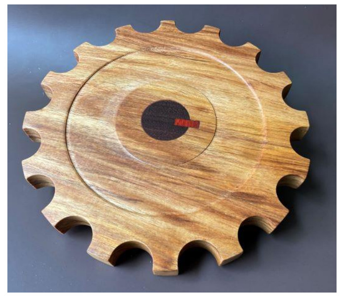
From Chuck Bajnai: kitchen trivet, unknown wood, walrus oil finish.