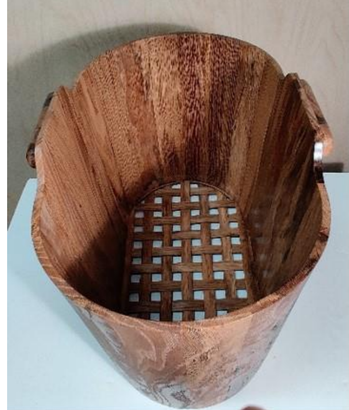
From Steve Kellner: recycle bin, 12" x 20" x 14" tall, white oak with splayed stave build. It is finished with Rock Hard Tabletop varnish. He says this was challenging 'flat work' with lots of hand fitting!