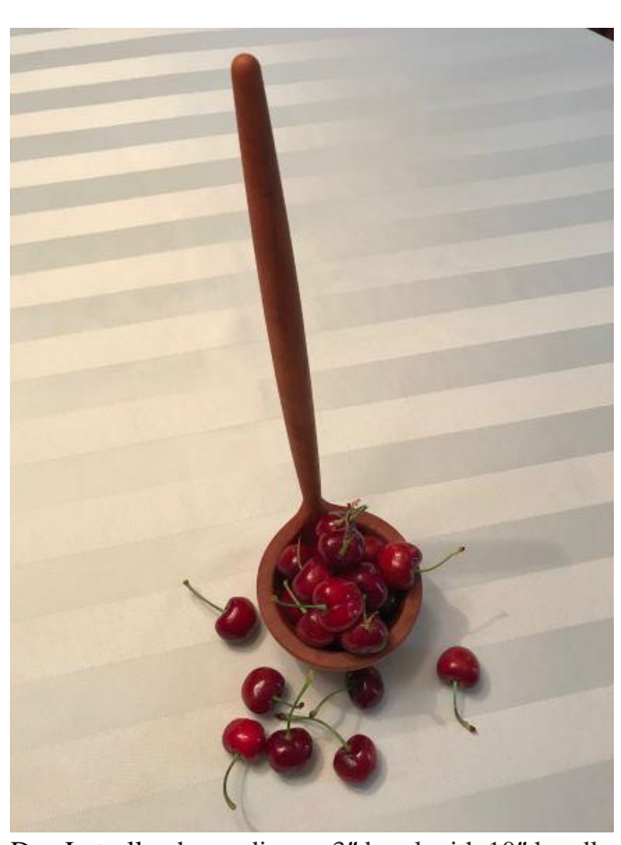
Dan Lutrell: cherry dipper. 3" bowl with 10" handle.