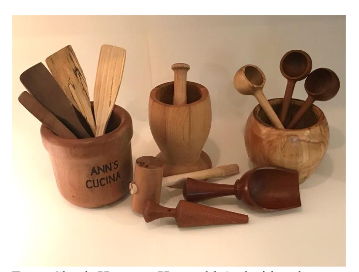
From Chuck Horton: He couldn't decide what one item to submit. L to R, paperbark container with spatulas, meat mallet, large mortar and pestle for making basil pesto (glued up maple), pizzelle maker (front), cherry scoop, cherry limb bowl with assorted dippers.