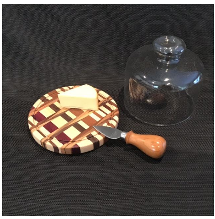
From Bill Buchanon: cheese dome and cheese knife; maple, walnut, cherry, sassafras, oak and Gouda