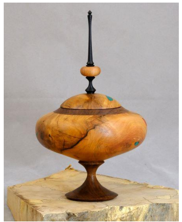
From David Bushman: This is a pedestal lidded vessel with a spalted maple body and lid. The pedestal and ring are black walnut.