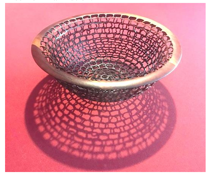
This is his "Turning of year." "Hollowbowl", cherry, artificially aged. 12'' dia. x 4-1/2'' deep.