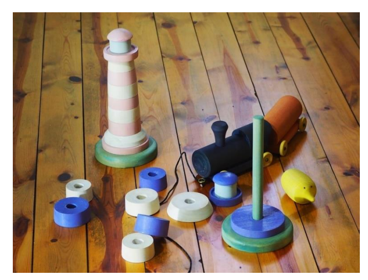
Lighthouse stackers, pull train and hedgehog.