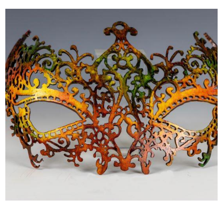
The mask is maple, about 15 cm.