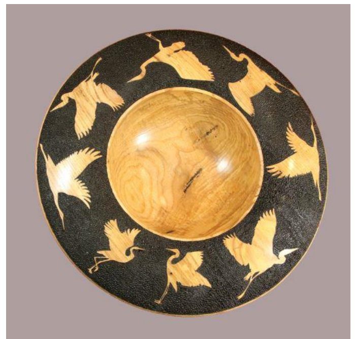
Ash Bowl with Herons 15" dia., x 4" tall