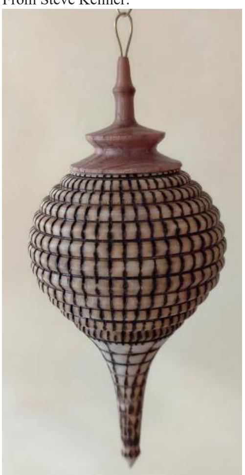
S&T: beaded Christmas hollow form ornament, magnolia and tulipwood. 2" x 5", no finish. He used a beading tool that he wanted to try on something small. The wood burning tip was too hot so smoke 'stained' the Magnolia. He doesn't have any paint pens yet and hasn't come up with a pattern so he left it plain.