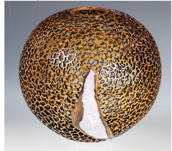
Hollow form: cherry, about 20 cm.