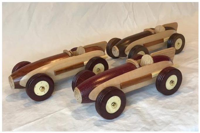
Race cars: purpleheart, ipe, walnut, and maple. Length: 8".