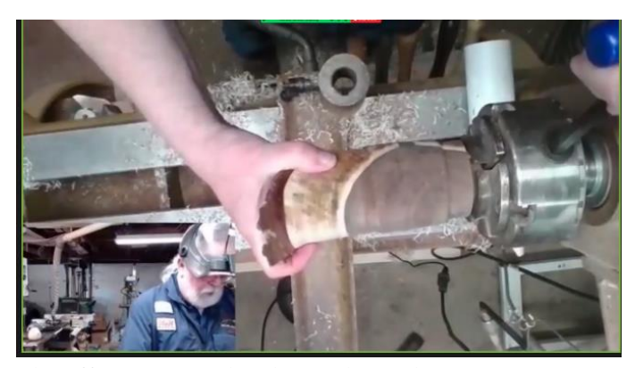
The off-cut mounted and turned round.

When final turned, it makes an interesting piece with a natural edge and unusual grain orientation. Do not shape it as a goblet with a thin stem, because the grain orientation is too weak. See more by searching for "Ron Campbell woodturning" and "AZ Carbide".