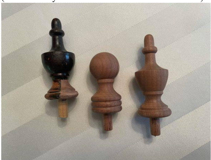
Repair pieces for an antique mirror. Two new, one repaired mahogany. Finish to be applied by client.

(Inadvertently left out of the November newsletter)