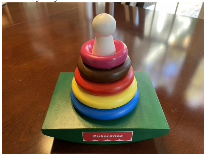
"Pisher Frice" Rocking Ring Stacker. Turned poplar painted with acrylics and a lacquer clear coat.