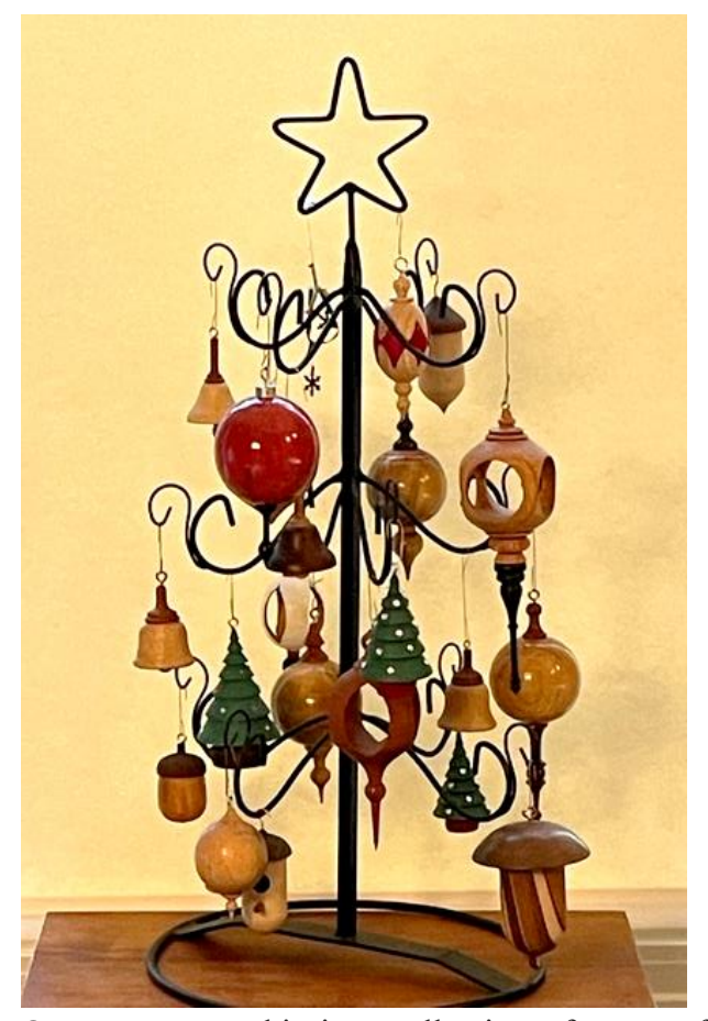
Ornament tree: this is a collection of some of the ornaments he made for Christmases past.