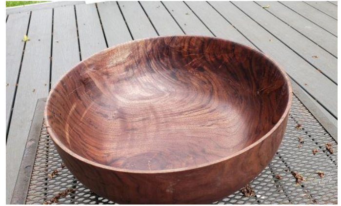
"I know lots of people don't make bowls smaller than this, but it is my largest/heaviest bowl ever - 12" diameter, 4.7/8" tall, dark walnut."