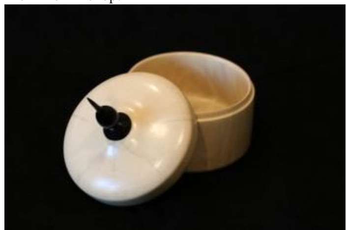
This is holly and ebony, finished with Berlin's Paste Wax. It is 4" x 4".