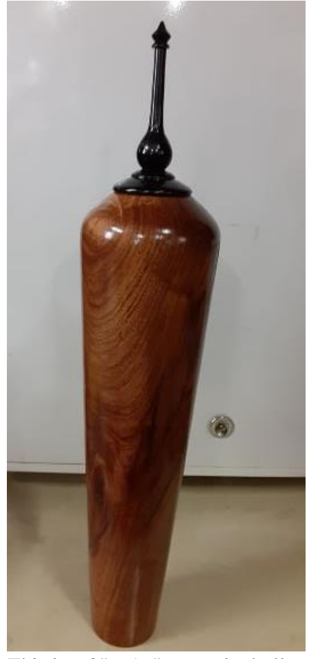
This is a 3" x 16" mesquite hollow form with an ebonized maple finial and a lacquer finish.