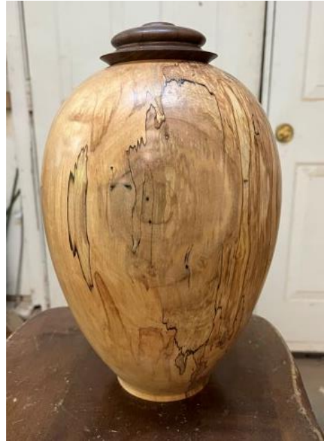
This is a burial urn for a friend that I am putting the finishing touches on. The body is spalted silver maple with a walnut lid. It is 8.5" dia. x 11.5" tall.