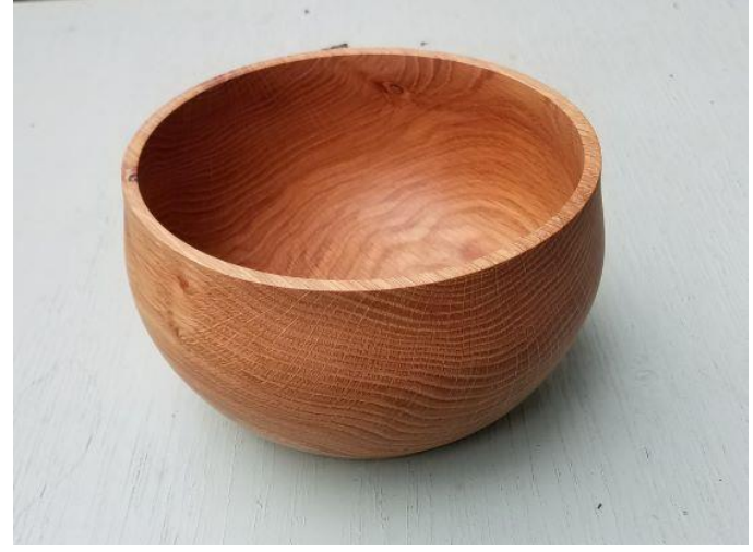
This is a red oak bowl with a Butcher Block Oil finish, 9.5" dia. x 5" high.