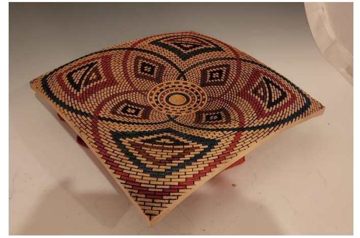
Square Maple turning blank done in the Basket Illusion style, while maintaining the square shape! The design is just what looked good at the time!