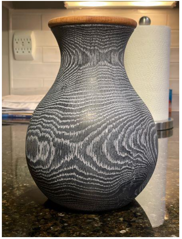
White Oak, burned, brushed, dyed, liming wax, mineral oil. 9-3/4'' high x 7'' dia. x 5/16'' wall