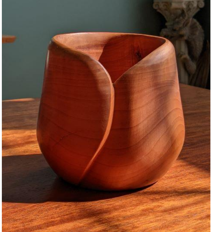
Wild cherry 8" carved bowl, Yorkshire grit and home-made friction polish.