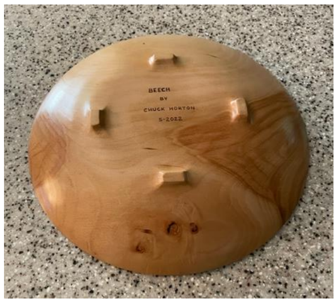
This is beech, about 9 1/2'' \ge 1/2'' . This is my second footed bowl. The turning blank came from a series of cored bowls a couple of years ago. The finish is Minwax antique oil.