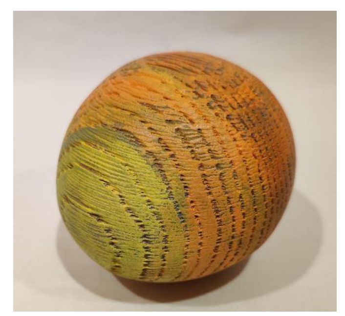
"Dinosaur egg"; white oak, grit blasted, 3" x 3.5", base paint light gray with yellow to red shading.

This is the same egg with dark gray base paint and yellow and red shading.