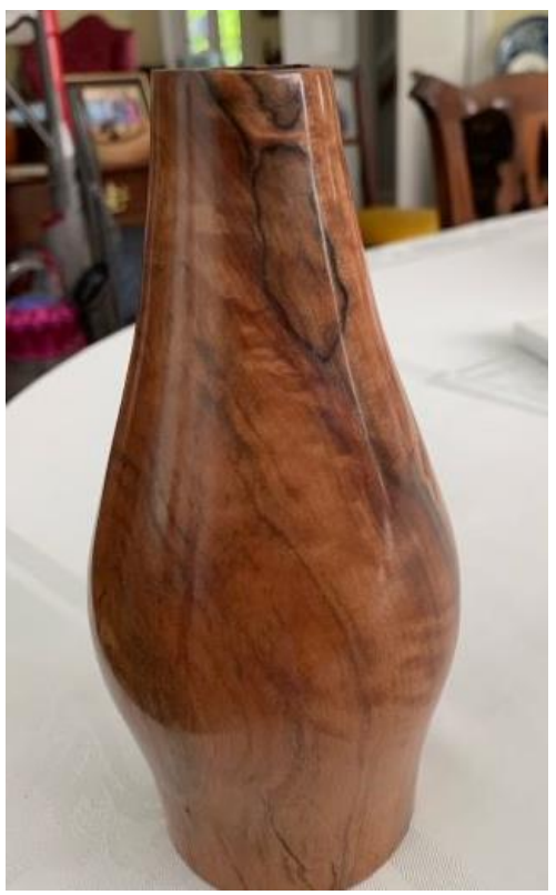
This vase is from the firewood pile. Cherry, turned, hollowed, sanded, and buffed.