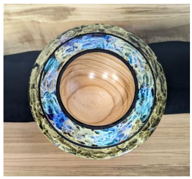
Silver Maple 7", black lacquer, Josanja luminescent paint,air brushed.