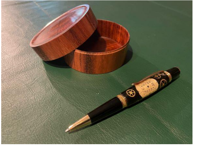
Here is a small lidded box made from Goncalo Alves. It is scrap wood left over from lest months box. Suitable for piercing. Also a pen.