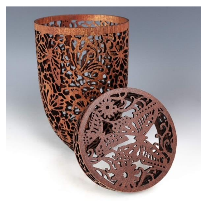
Butterfly box, Size about 15 cm (about 6"), mahogany