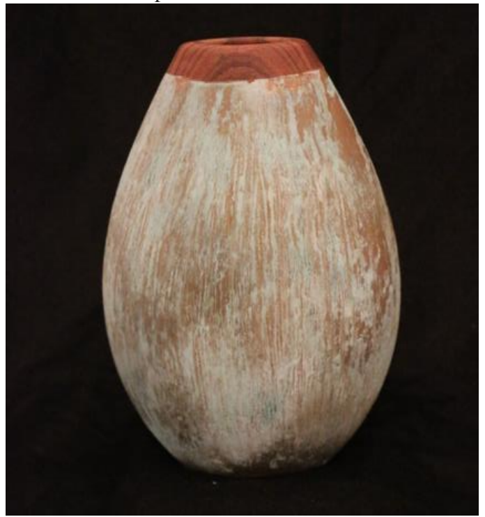
This is maple and Bolivian rosewood, painted with reactive copper paint. It is 7'' \ge 5'' and was turned using the lost wood technique.