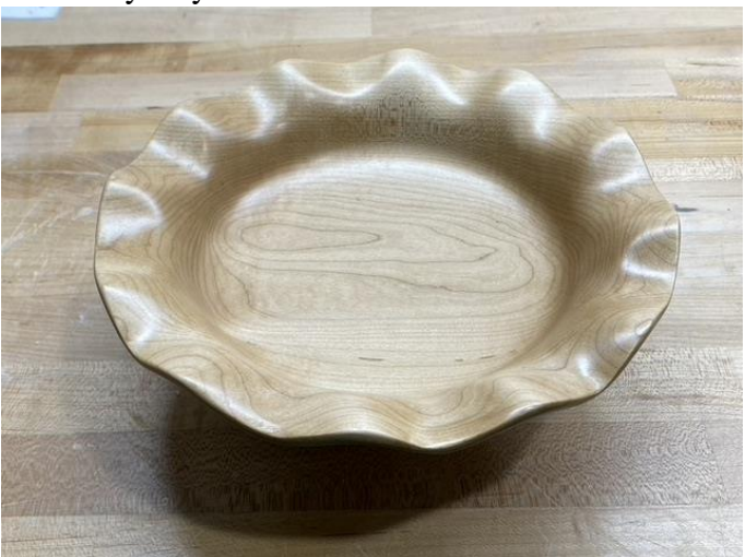
This is a 2" deep hard maple bowl, 9" in diameter and finished with wipe-on poly. It has a carved embellishment on the edge.