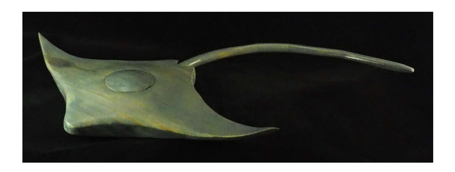
Stingray (winged box) made with a scrap piece of 2x8, 13" wing tip to wing tip, stained with a Minwax Poly stain.