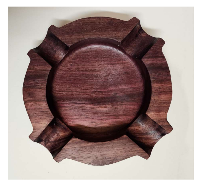
Turned and carved Cigar ashtray. Purple Heart and Rubio Monocoat