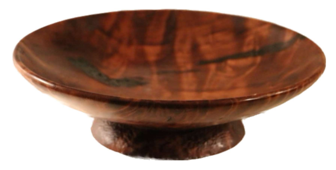
12 ½" x 3 ¾" Walnut Root Burl Liberon Wiping Oil