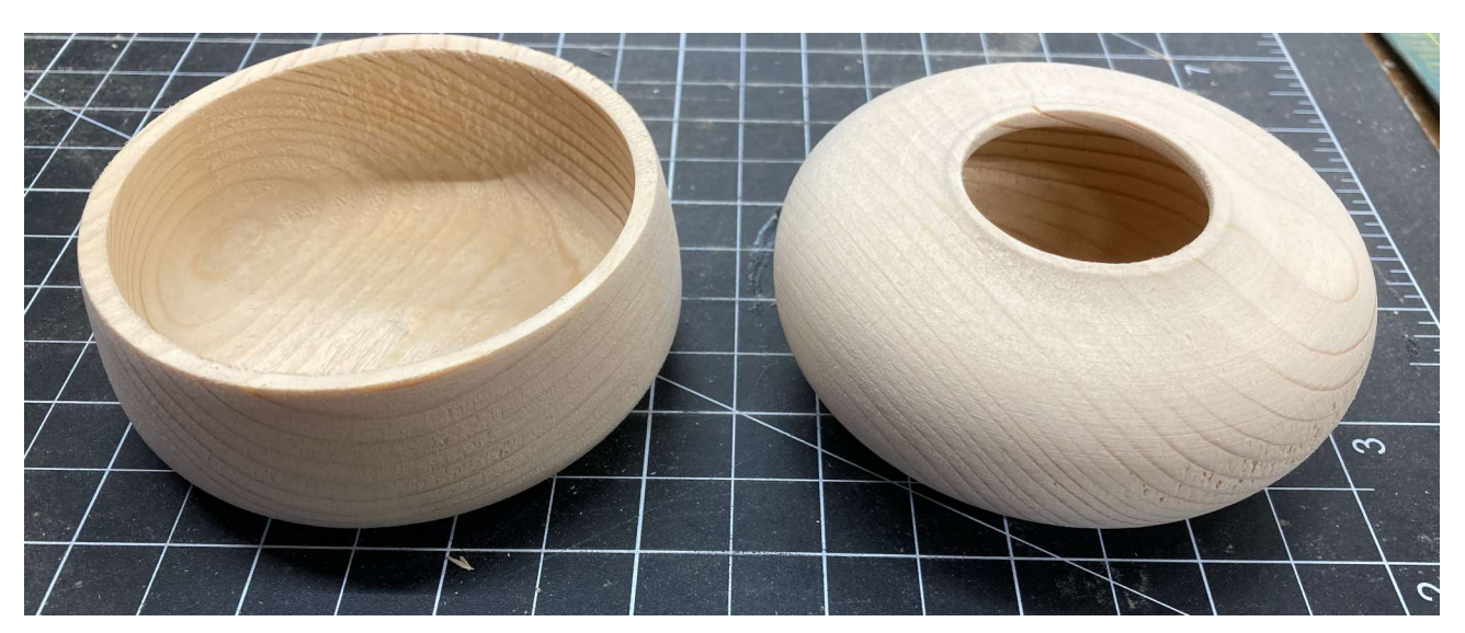
They are both turned from a 2 x 4 scrap.