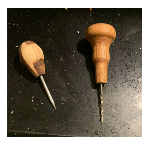
2 awls I made