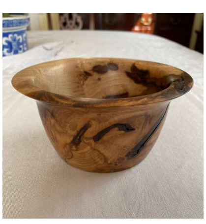
This is Hickory wood. Filled with voids. Dry and very dusty to turn. Beautiful wood. Wax finish. 4" high x 5" wide.