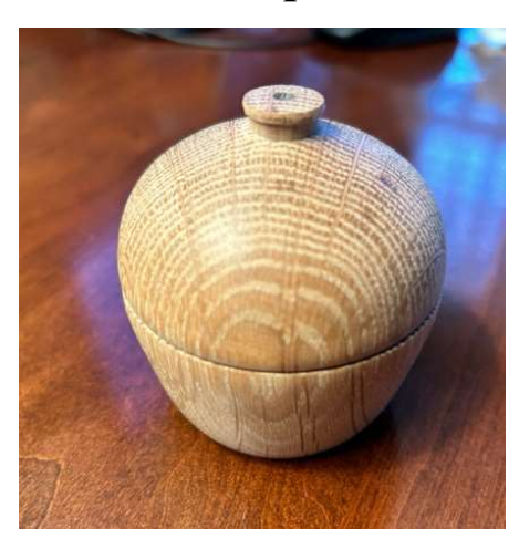
2" by 3" red oak box. I finished it, removed both tenons, sanded to 1000 grit, and set it aside. The next morning the top no longer fit. Returned it to the lathe. It fits well now.