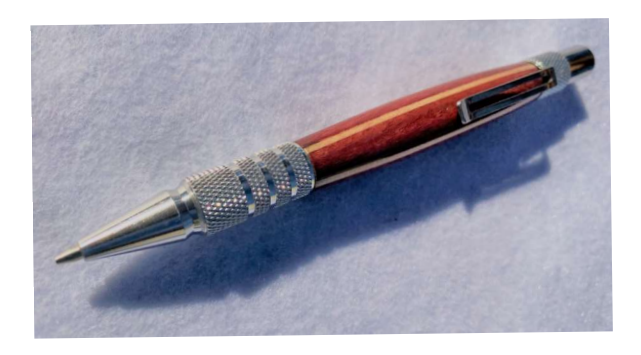
Redwood and basswood. Finished it with CA glue and Magic Juice.