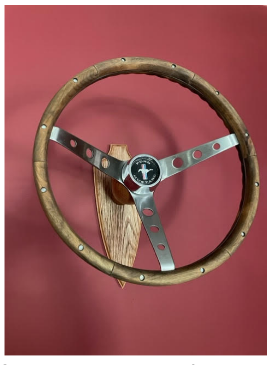
Celebrating the invention of the wheel. 1964. I didn't turn the wheel, just the steering column.