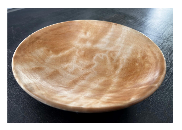
7.5 x 1.25 inch quilted maple dish. Finished with Watco natural Danish Oil.