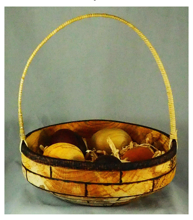
Easter basket and eggs, reed handle. Basket is 9.5" in diameter.