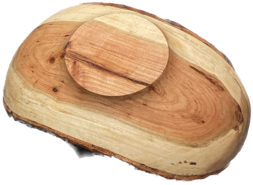
This is from a cherry limb, turned side grain. 9" long x 3" high x 5 1/2" wide. One coat of wipe on poly, so far.