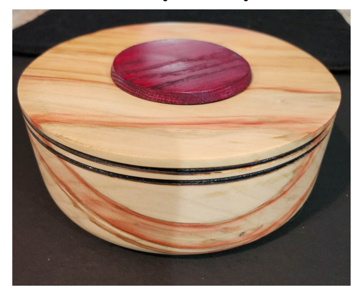
Box elder bowl and small lid. Yorkshire grit and Myland's friction polish