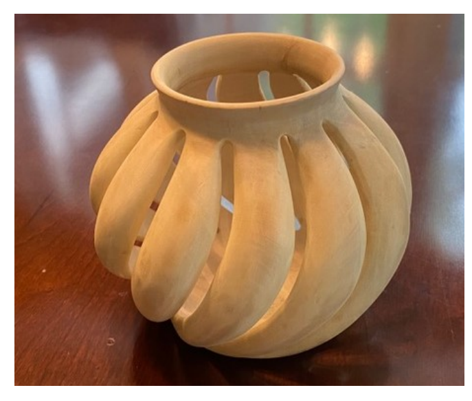
Holly open twist hollow form.