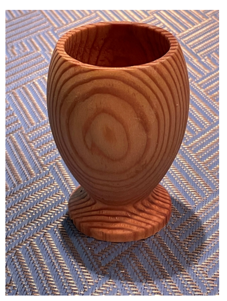
This is fir from a 4 x 4. 4" high x 2 3/4" wide. It started out bigger.