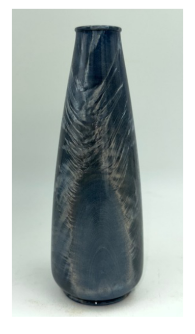
Maple hollow form from crotch area. Dyed and finished with lacquer.