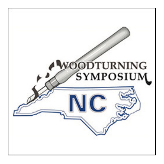
North Carolina Woodturning Symposium November 3-5, 2023 Greensboro Coliseum, Greensboro, NC