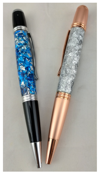
Two Sierra pens. Blanks made with colored bits of foil cast in resin. I sprayed glue on tubes then rolled in foil.