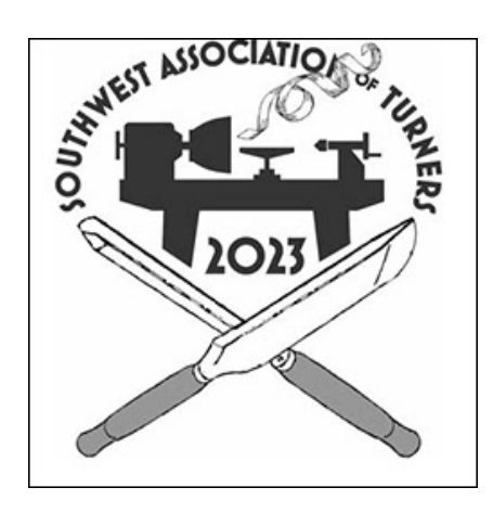
SWAT 2023 August 25-27, 2023 Waco Convention Center, Waco, TX