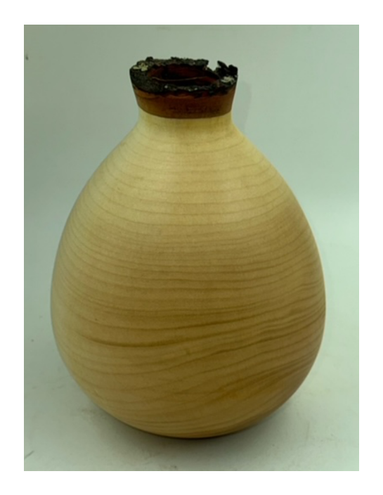
Maple hollow form. Ty oil finish buffed.