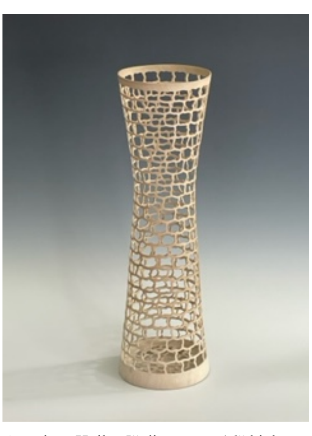
American Holly 5" diameter x 16" high