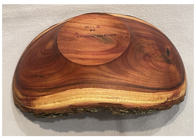
Milo from Oahu, 9" long x 6" wide x 3 1/2" tall. Sanded to 400 grit with two coats of Watco Danish oil.