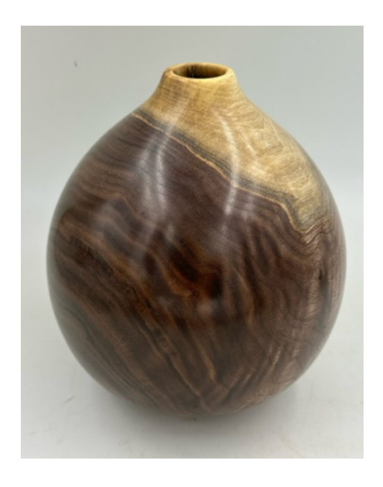
Walnut hollow form finished with tung oil then buffed.