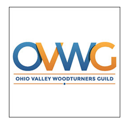
October 13-15, 2023

The Higher Ground Conference & Retreat Center, West Harrison, IN