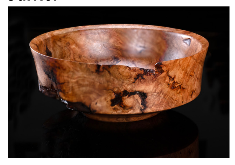
Cherry Burl, 8"x3.5" finished with Rubio Monocoat