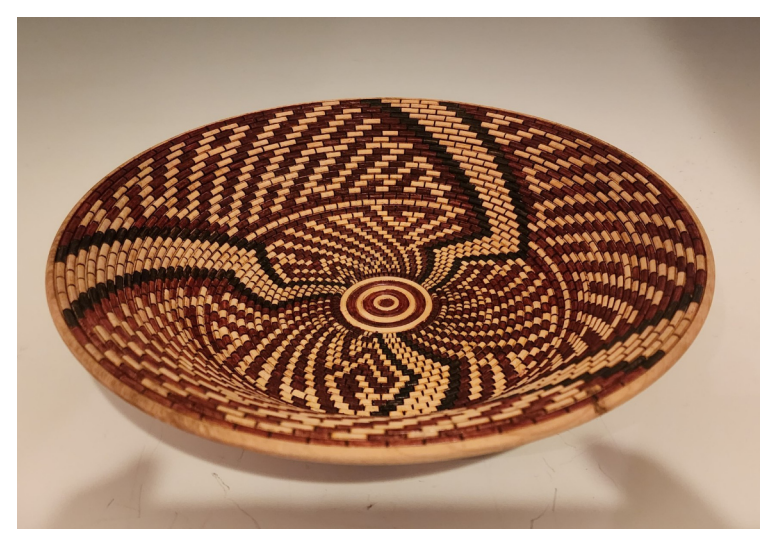
Another basket illusion technique bowl. Instead of a regular geometric pattern, I created a "find the path" puzzle bowl. Find your way from the outer ring down to the smallest ring near the center of the bowl. Don't think I'll do that again!