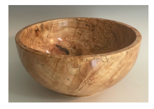
Front yard maple. 10-1/2" diameter x 5" tall. Wipe on poly.