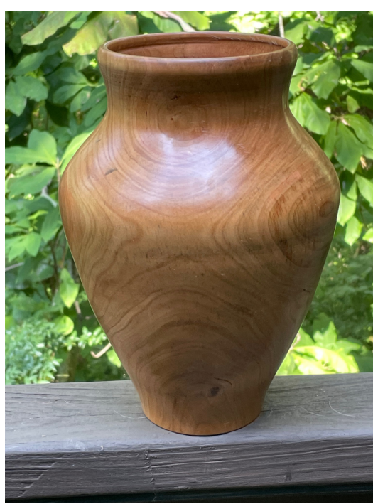
Cherry, 9" high x 7 1/2" wide. Finished with Watco Danish Oil,