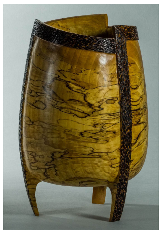
Footed, carved and embellished spalted beech vessel. It is 8 1/2" tall and 5 1/2" in diameter.