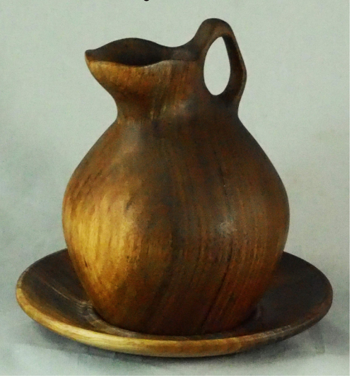
Walnut Ewer and Saucer, finished with Walnut Oil