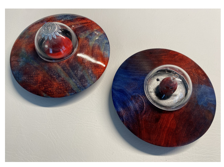
Poplar, dyed, each has a different lacquer finish- gloss or satin.