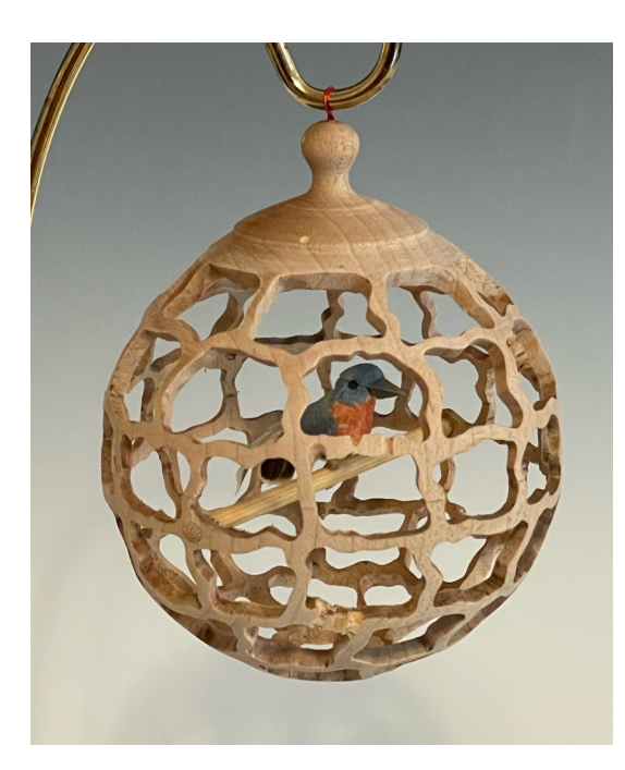
Blue bird on skewer. Bamboo and wormy maple.