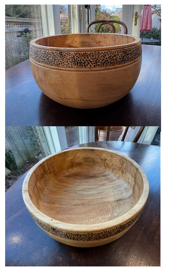
Spalted Cherry 5" x 10" . Textured on top with pyro tool