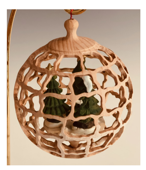
Snowy evergreens. Hard maple.