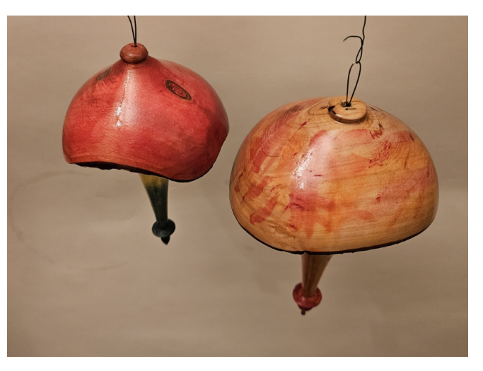
Smaller ornament with red top (last meeting demo piece), 3"x 5" and larger 4"x 6.5". Both are colored with Trans-tint dye and finished with spray lacquer. Need to work on my colorization!