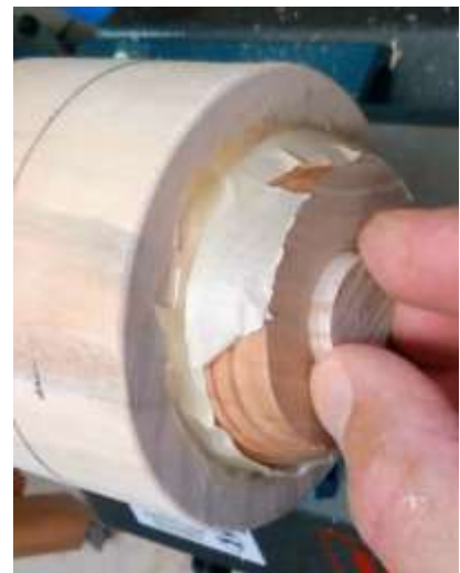
Figure 6 Shaker glued in mold. Fit the lid in reverse.