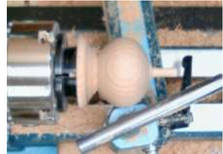
Figure 4 Shape of the main axis of the shaker