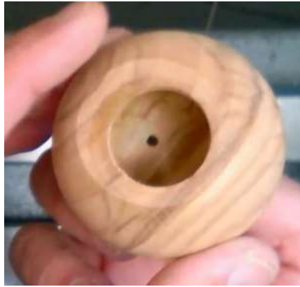
Figure 5 Shaker from below. Closed and open.