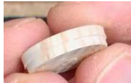
Figure 3 Lid with two diameters