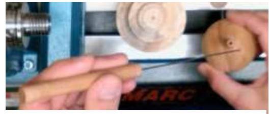
Figure 1 12-gauge coat hanger probe

Probe: 6" 12-gauge stiff straight coat hanger wire, wood handle