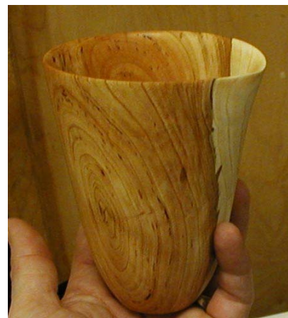
A Turned Green Cup