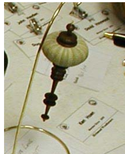
A Green Sea Urchin