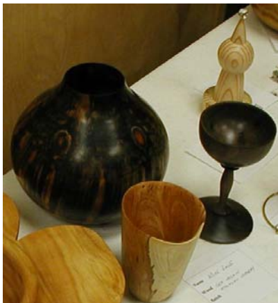
Have a Drink Anyone? Maybe some green tea?