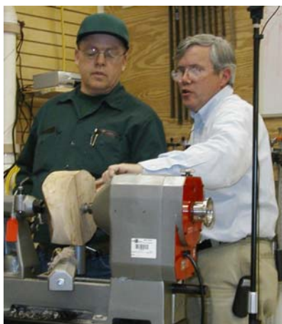
Discussing Mounting Bowls