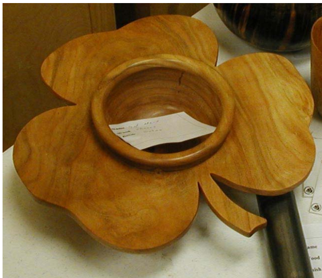
A Piece Inspired by The Green Wood And the Green Holiday