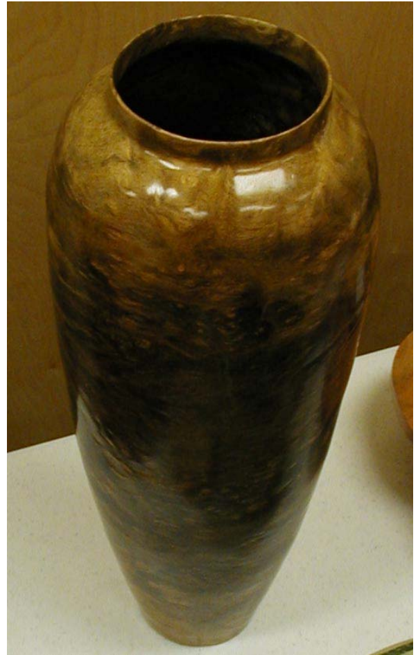
A Large Green Vessel