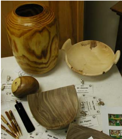
More on Green Turning!