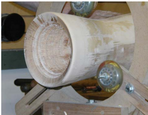
First End Roughed Out (leave center rough)