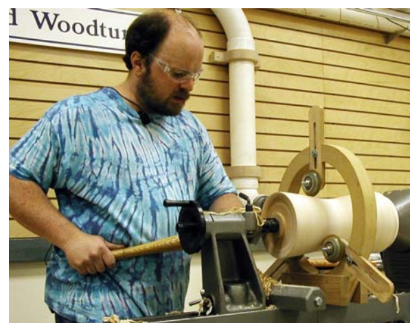
Faceplate, Steady Rest & Center Support