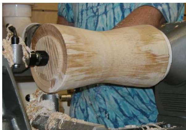
Faceplate Turning With Tailstock Support