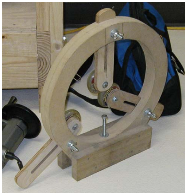
A Nice Homemade Steady Rest