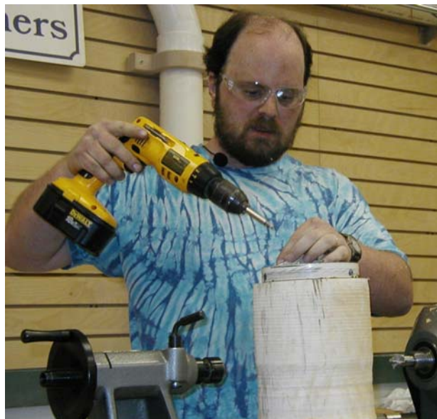
Faceplate Preparation with MANY Screws