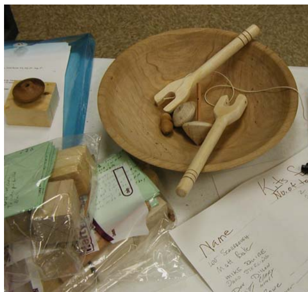
4H Project Tops