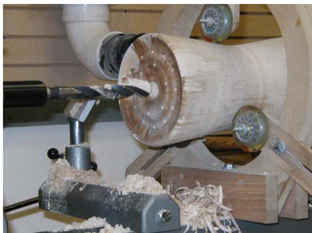
Drilling Out Opposite End