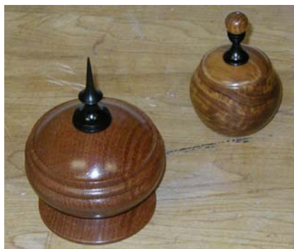
Pop Lid Boxes