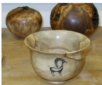
Art Work Enhancement