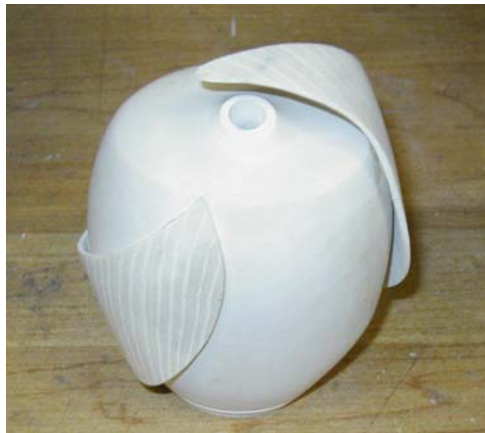
One of Tom Crab's Best Yet