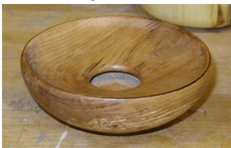
Something a little different.