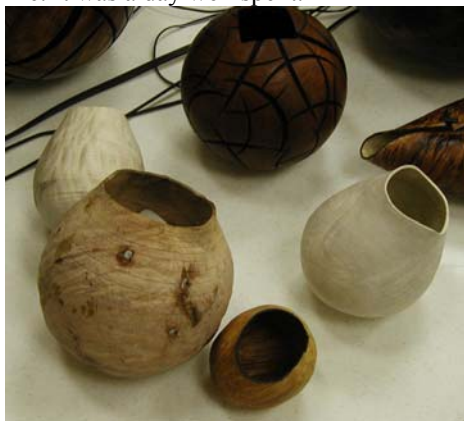
Some of his work.