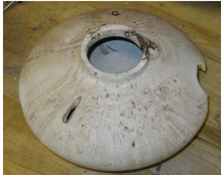
Nice Hollow Form