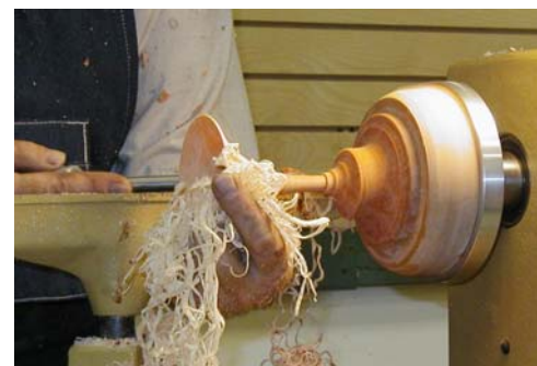
Fingers get a little hot. Use the wet shavings.