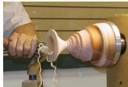
Stepping down a little flower.

Some more wet wood. Can't you see it dripping off the tool post?