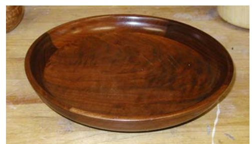
Nicely Done Segmented