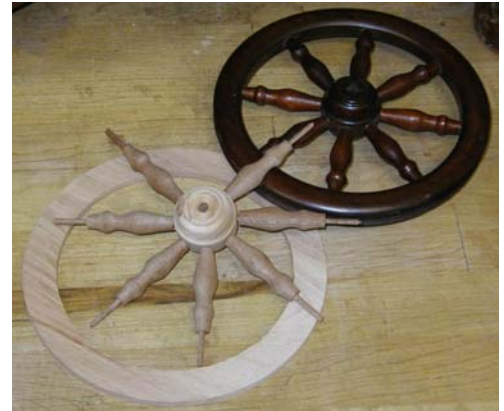
Repairs Under Way