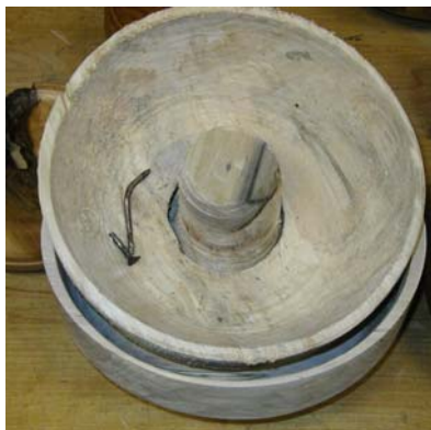
Ever Tried to Turn a Nail?