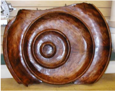
Quite Large and Quite Beautiful