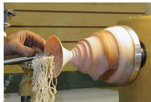
Adding a little finger support.