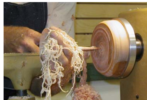
Keep holding until it is finished.