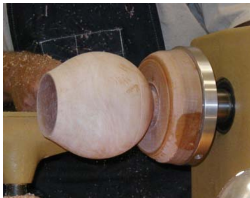
One of his favorite shapes.