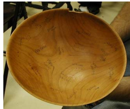
Bowl Signed By 4H Youth and Counselors 2005

have touched with our program. Let's continue the good work.