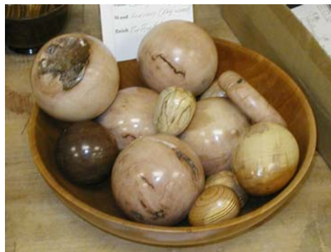
Don't Put All Your Eggs In One Basket : )