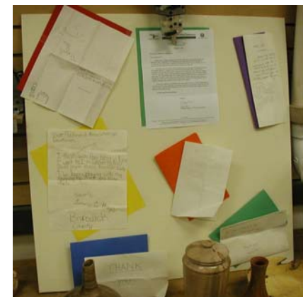
A Special Thank You from 4H!