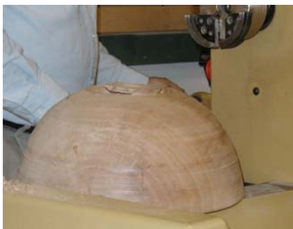
A little misfortune! Most likely due to the wood being to dry.