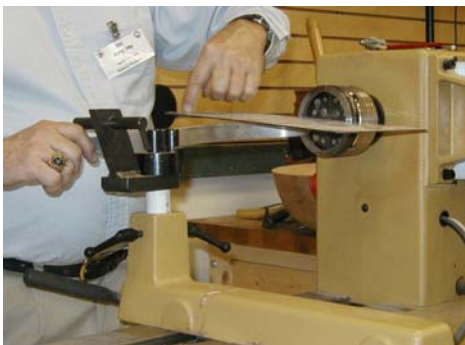
A good cut starts with a good layout.