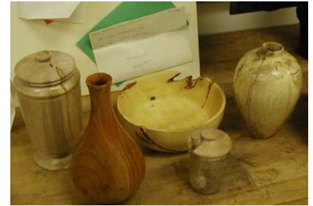
We Do It All