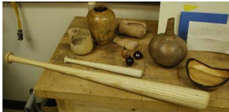
Is Someone Thinking Louisville?