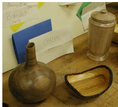
A Real Variety