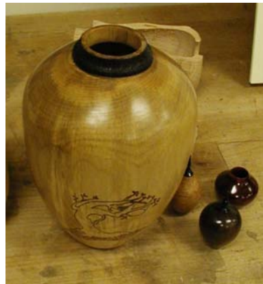
The Big and The Small