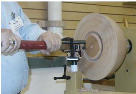
Time To Dig In