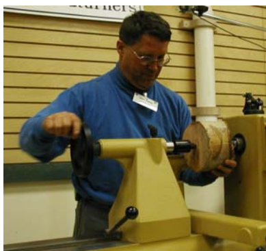
Mount the blank between centers.