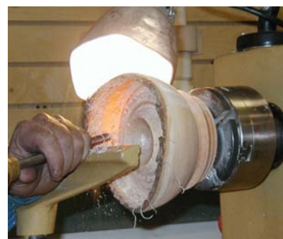
Guide by the light.