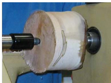
Rough turn the outside.