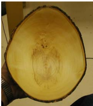
Natural Edge Bowl w/Raccoon

This sample of thin wall green wood turning shows the warping after drying.