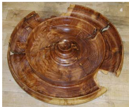
Natural Edge Platter