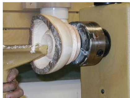
Begin the hollowing process.