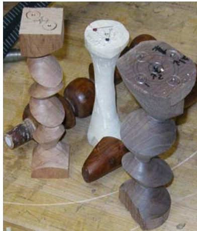
Note the markings on the ends