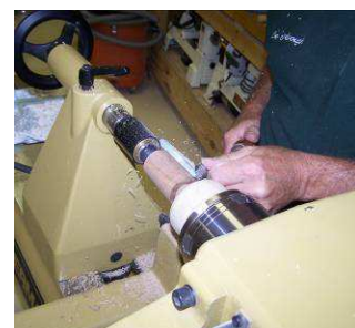
Bottler Stopper Jig