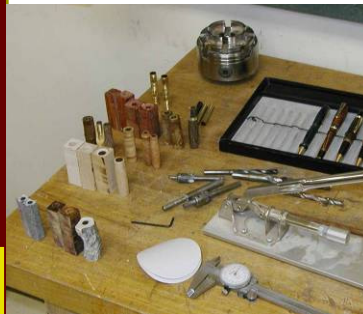
First gets lots of parts together

[Pen from page 1 ]will buy something) and make nothing, but not waste much wood either. Well good pen turning & someone make a feather quill pen just because.