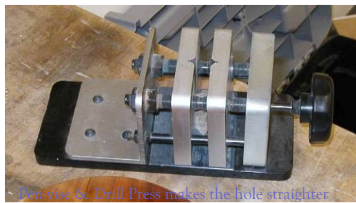
Pen vise & Drill Press makes the hole straighter

times the pen will crack after they are finished; hold on to them for a while before selling just in case. Danny likes pen turning for demos. He says you can turn all day, talk to people passing by (good customer service & maybe they [Continued page2]