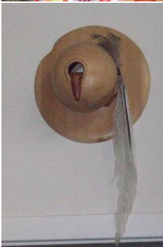
Turned hat broke? Give it to Penny to make a wall hanging