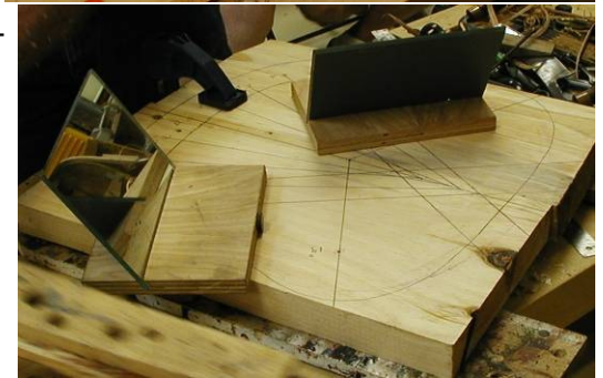
Bending the arms & back

Please alert your membership about an unique event scheduled in a few months. This will be the very first symposium exclusively organized for "segmented" turners. The dates are November 14th-16th at the Marc Adams School in Indiana. All the details are posted on the event website at: http://www.segmentedwoodturners.org/