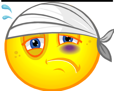
Safety is everyone's concern