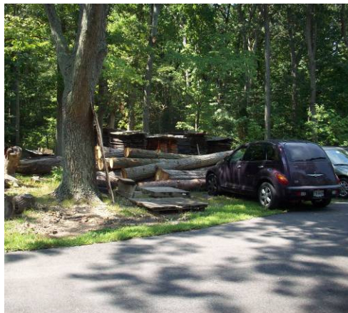
Part of Sid's wood collection