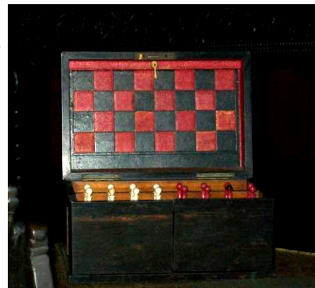
Wonder if I can build a Chess Set