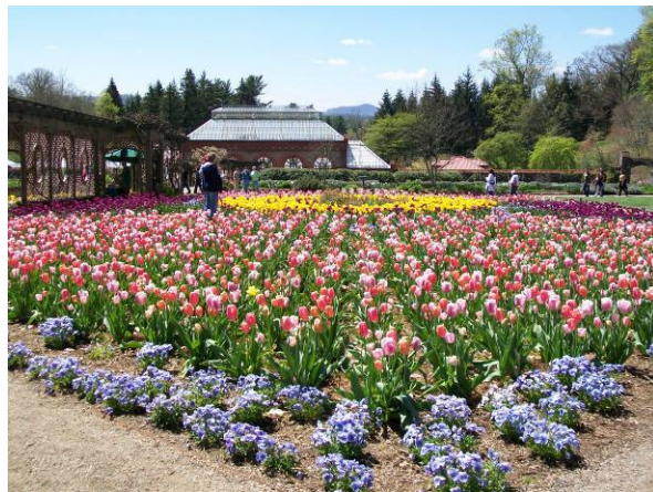
Biltmore gardens in bloom

I took face carving (only beginning turning was offered this weekend) as that was available at the same time hubby wanted to take intro to blacksmithing. We had only 4 people in the class; [Continued on page 2]