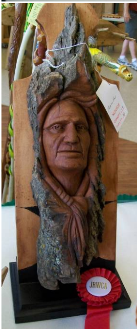
My JC Campbell Project