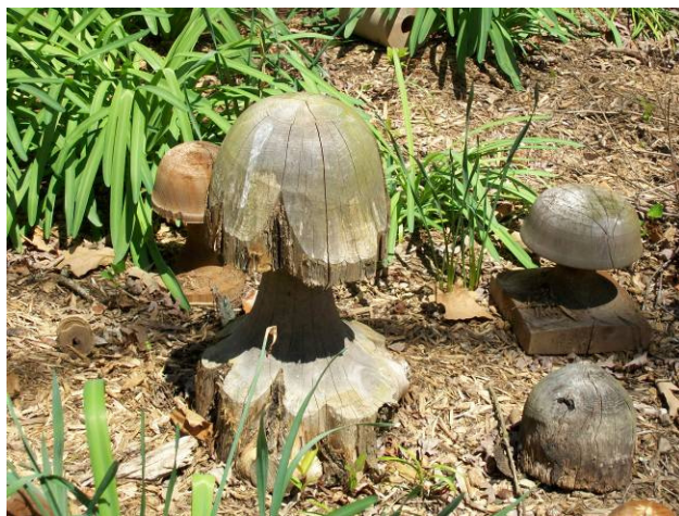
Oak Mushroom Garden at JC Campbell