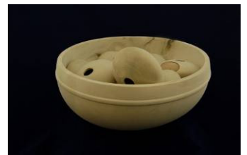
Show & Tell: Plate, Trivet, Urn top, Top/Box, bowls, homey dipper, pens, goblet