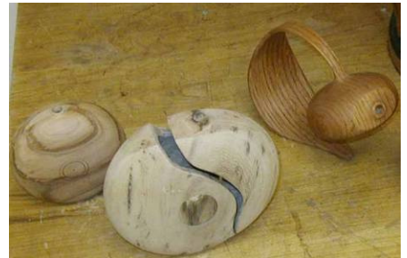
A few of Tom’s creations