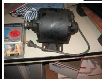
Single phase motor 14Hp 1725 rpm