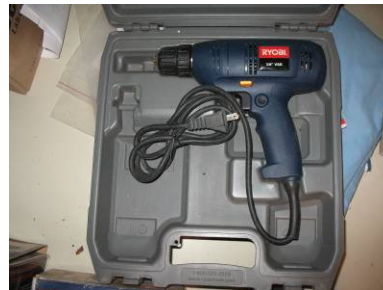
Ryobi VRS Drill with case

Don't forget to bring some items for donation at the Club's new Monthly Silent Auction Table . Wood blanks are really appreciated by the membership along with tools and accessories. Some of the items that will be featured at the table in the future are pictured below. All proceeds go to the club treasury.