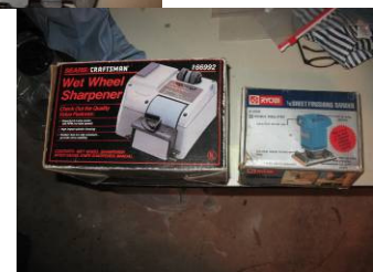
Craftsman Wet Wheel Sharpener