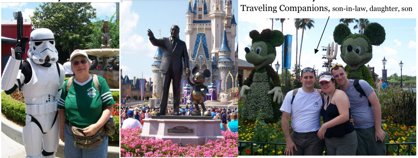
Traveling Companions, son-in-law, daughter, son