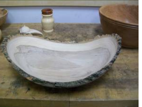
Things: Hollow vessels, pepper mill, natural edge bowl, bread, big bowl

Wood: maple, ash, mulberry, black ash, holly, cherry, oak, camphor, glue-lam, walnut, cocobolo, box elder, cedar