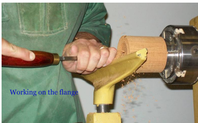
Working on the flange