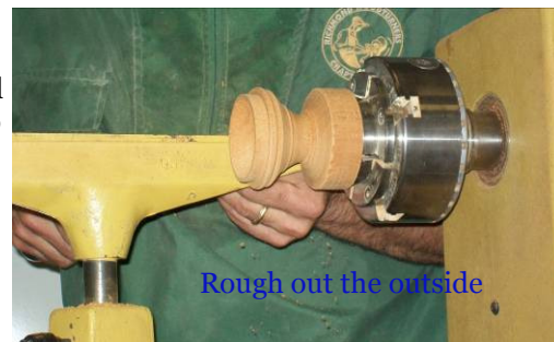
Rough out the outside

Mount the base in the chuck. Drill out the center; use a bowl gouge to widen it, clean up the edge, sand. Cut the shoulder last. Sneak up on the fit. Parallel shoulders are a must. Check the fit. Chamfer the inside of the base rim. Too loose, cut it off and try again. Mount the lid on the base and finish turning the lid. Turn the outside; add a bead or decorative touch to hide the joint. Part off the base and make a jam chuck out of the mounted waste. Mount the base and finish off the bottom. Check the web site to download Roy's more complete handout.