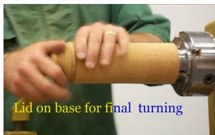
Lid on base for final turning