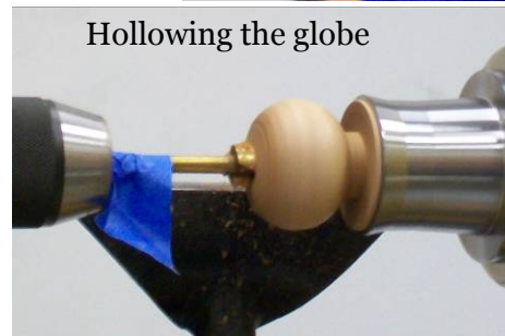
Hollowing the globe