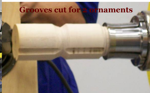
Grooves cut for 2 ornaments