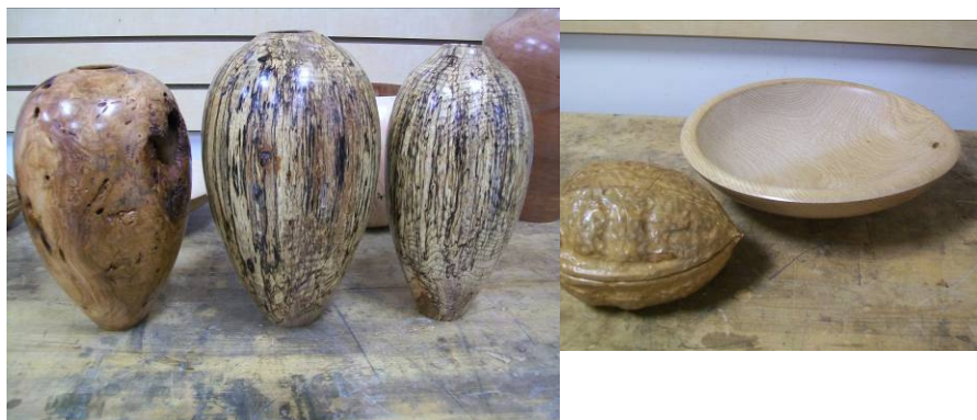
[Finish from page 1]

November 4-6 , NC Woodturning Symposium, Greensboro