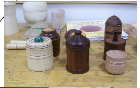
Blue Painter tape